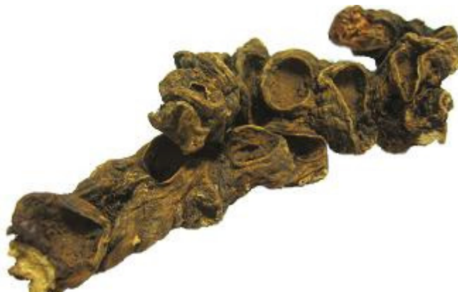
Figure 2. Dysosma versipallidis rhizome (root), in Shennongjia.