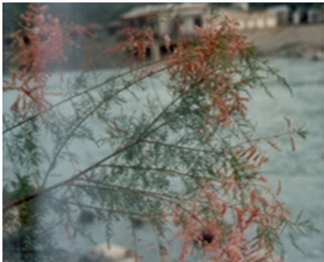
Figure 3. Flowering and fruiting plant Tamarix dioica Roxb. ex Roth.

against splenetic inflammation. Powdered of bark is used for wounds.