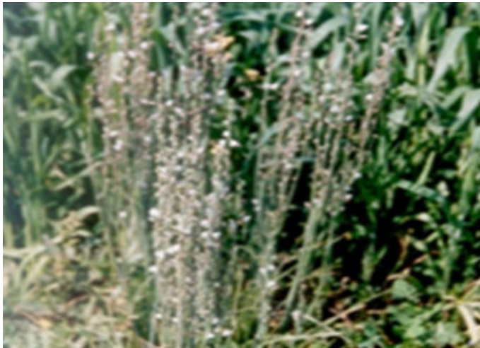
Figure 1. Flowering and fruiting plant of Asphodelus tenuifolius Cavan.

eyes problems. This extract also has cooling effects. Seeds are used in sexual disorders. It is thought that seeds are bedded in a thread and hanged in child neck that relief pain; when baby start to grow teeth.