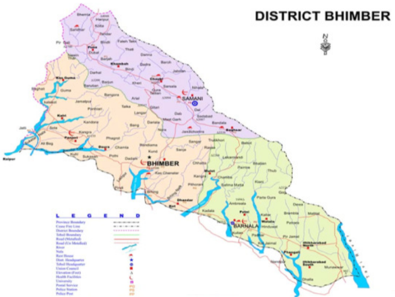
Figure 5. Map showing Bhimber District, Azad Jammu and Kashmir, Pakistan.