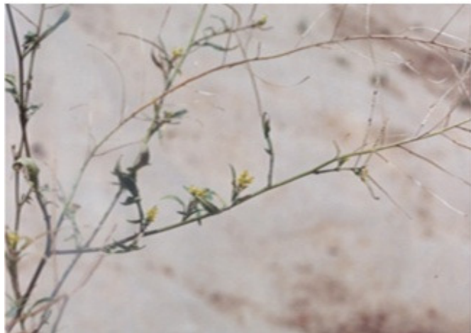
Figure 2. Flowering and fruiting plant of Sisymbrium irio L. ex Steud.