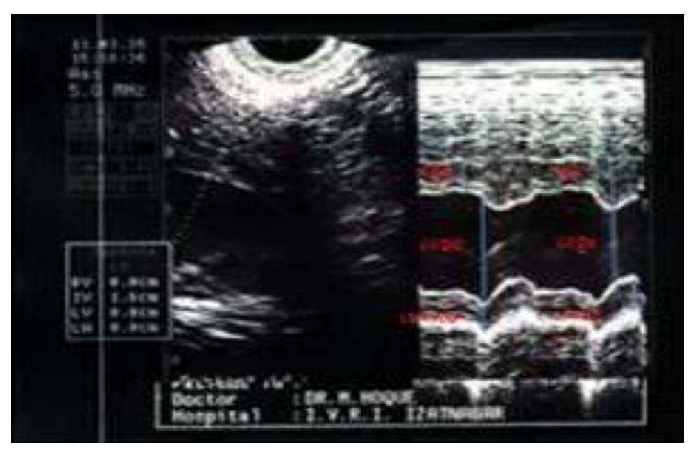
Figure 3. Measurements of left ventricular structures during systole and diastole (LVDd,s-left ventricular diameter during diastole and systole; IVSd,s - interventricular diameter during diastole and systole; LVPWd,s - left ventricular posterior wall during diastole and systole).

kW(1/3)). Use of these indices circumvented undesirable statistical characteristics inherent in linear regression of echocardiographic dimensions against body weight and, to a lesser extent, body surface area. Compared with the regressions, ratio indices resulted in substantial refinement of the predictive range for each M-mode measurement in dogs, particularly with decreasing body size.