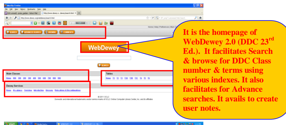
Figure 1. Homepage of 'WebDewey 2.0'.