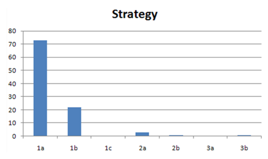
Figure 1.The frequency of strategies used by Clark for rendering PPN allusions in Hafiz Divan.