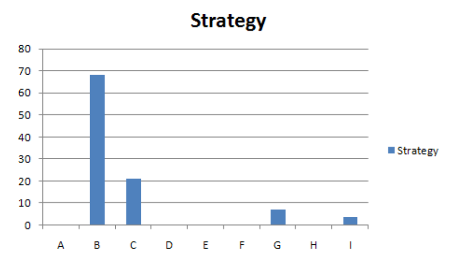
Figure 3. The frequency of strategies used by Clark for rendering key-phrase allusions in Hafiz's Divan.

day, the sorrowful cell becometh the rose-garden: suffer not grief (P. 260). The story of Joseph is almost known for every one, as a result of this, the translator retain the allusion, but here some lexical and orthographical changes are needed, as Yusuf should be changed to Joseph to remove obscurity.