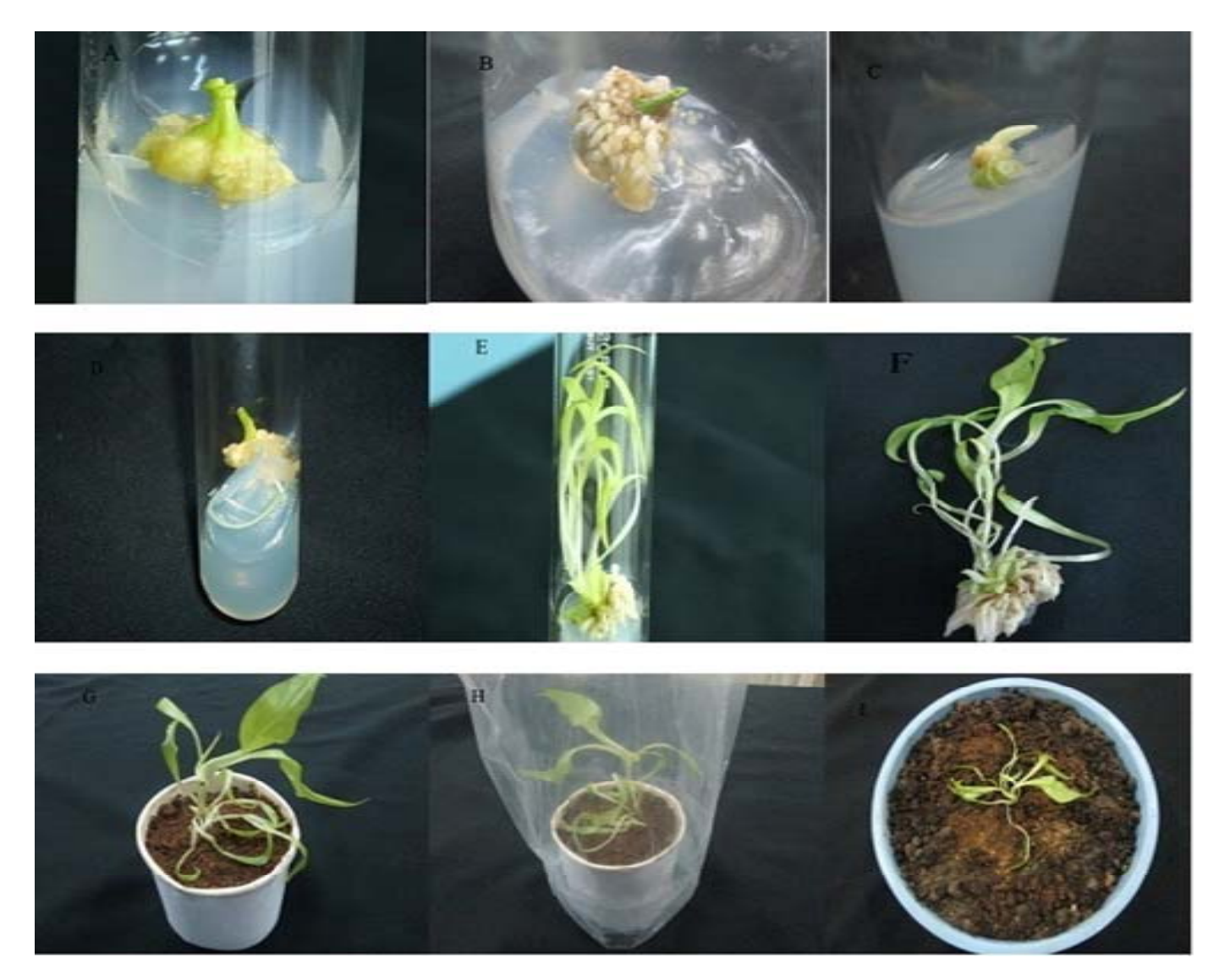
Figure 2. In vitro propagation of Gloriosa superba L. A- Callus induction, B- Somatic embryogenesis, C- Shoot induction, D- Root induction, E-F- Multiple shooting, G-I- Acclimatization.

comparison with the previous study, the hormone combinations used in the present study were better and faster for callus induction. Somatic embryogenesis and plant regeneration in G. superba L. was reported on MS medium supplemented with 2, 4-D (4 mg /l) + Kinetin (5 mg /l) + CH(10 mg /l) + CW(20%) (Jadhav and Hedge, 2001). But in the present study, maximum somatic embryogenesis was observed on the medium supplemented with 2, 4 -D (0.5 mg/l) + Kinetin (0.25 mg/l) along without CH and CW after 17 days of inoculation without subculture.