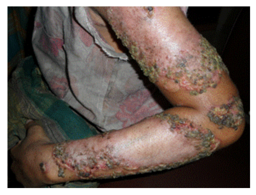
Figure 2. Showing TVC lesions over left arm and forearm.