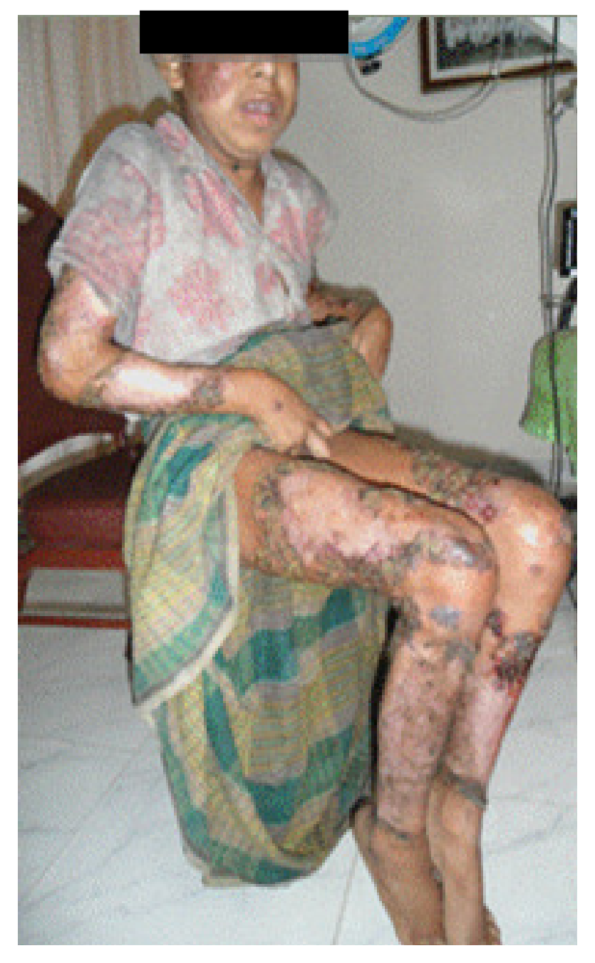
Figure 4. Showing TVC over all limb and face.

tuberculosis occurs in a previously sensitized individuals due to exogenous reinfection with M. tuberculosis and Mycobacterium bovis (Wolff and Tappeiner, 1999).The symptoms of mycobacterial infections depend mainly on the route of transmission, the pathogenicity and drug resistance of the bacteria, the immune status of the host and various local factors. Adult males are reported to be most commonly affected (Irgang, 1955), probably because they are more usually involved in heavy manual work and liable to chances of trauma infection, thus