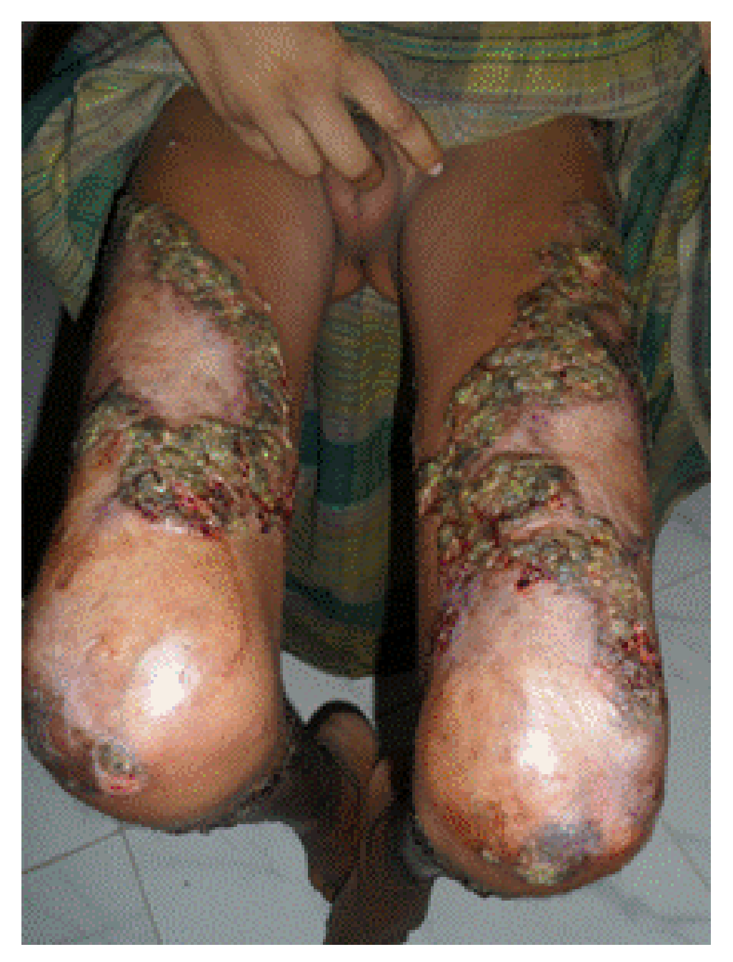
Figure 3. Showing TVC lesions over both lower limbs.

lymphadenopathy. Systemic examination did not reveal any abnormality. The mother of the boy patient gave information about family history of positive PTB association of the father. Routine blood investigations and chest radiographs were within normal limits. Mantoux test measurement indicated 17 \times 15 mm in size. Ten percent potassium hydroxide smear preparation was negative for fungus. Radiographs of the foot showed only soft-tissue swelling without bony involvement. Biopsy from the foot lesion was consistent with TVC, with marked hypertrophy of the epidermis and mid-dermal