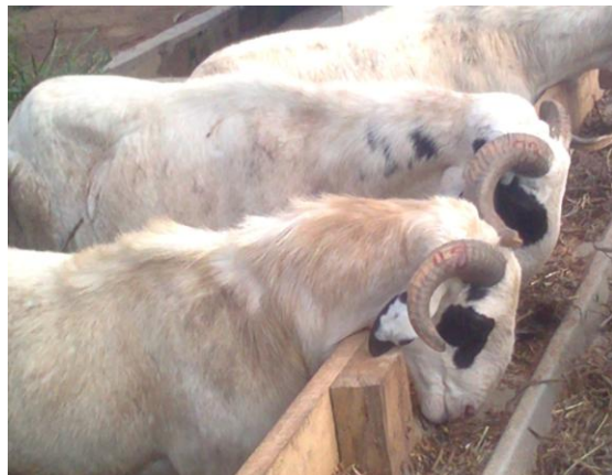
Figure 2. Yankasa rams (the flock in the University of Ibadan, Nigeria).

Nigeria as shown in Figure 3. A wide range of characters were used to produce the profile while each character was in turn split into corresponding specific external attributes. Genetic determination of the following traits was used.