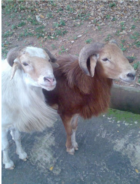
Figure 1. The West African Dwarf rams (the roaming flock in Ibadan, Nigeria).