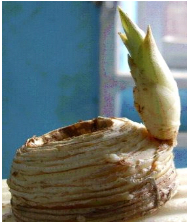
Figure 4. Erect emerging sucker with developing axillary buds.