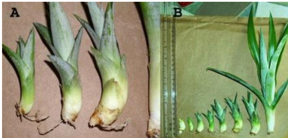
Figure 5. Variation in plant height and root formation of selected plantlets.