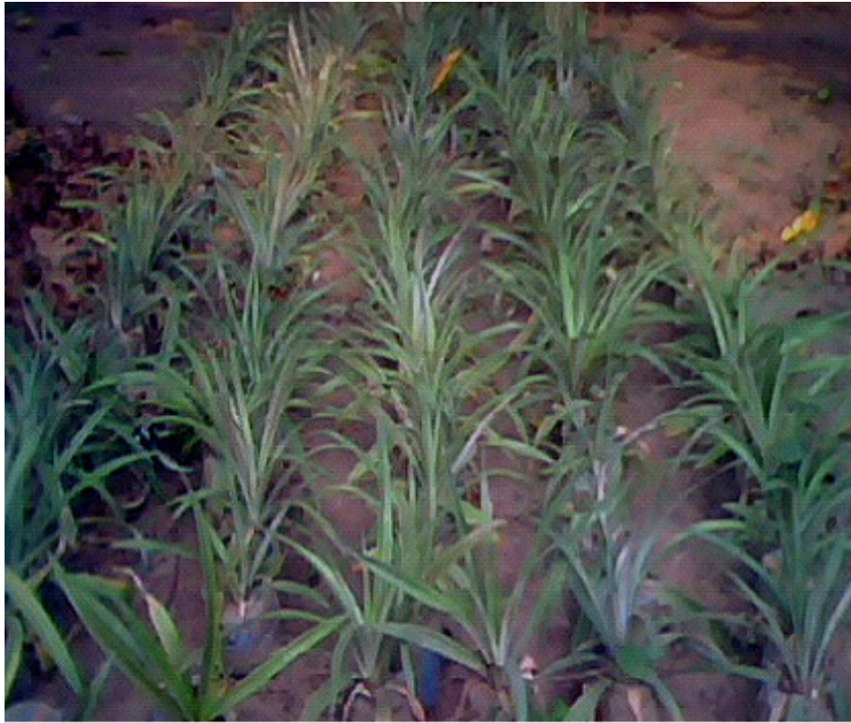
Figure 3. Selected plantlets potted in polybags containing topsoil in a nursery.

(Table 1). There was significant difference at the 1% level among the four treatments (Table 2). All the crowns with meristem destroyed emerged faster than the control. Mean difference between the control and T3 was significant at 0.1% level ( LSD_{0.001} ). Difference between T3 and T1 was significant at LSD_{0.05} (5% level of significance) while the difference between T3 and T2 was not significant (Table 3).