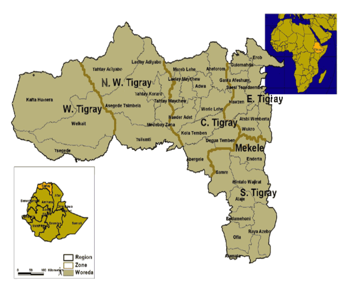
Figure 1. Map of Tigray regional state of Ethiopia. The site is located in Central Tigray.