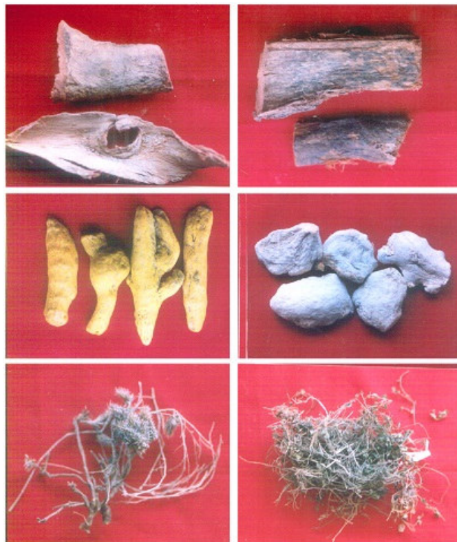
Figure 1. Figure showing the herbal medicines used in Rajasthan (Indian). (A) Bark of Terminalia arjuna (Arjun), (B) Bark of Bauhinia variegata (Kachnar), (C) Dried rhizomes of Curcuma longa (Haldi), (D) Dried rhizomes of Zingiber officinale (Sonth), (E) Barleria prionitis and (F) Bacopa monnieri .