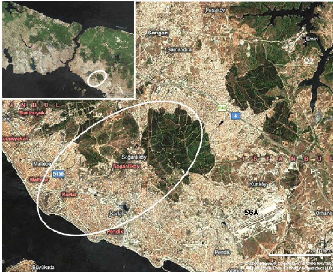
Figure 1. The satellite view of Istanbul (upper left corner) and the Kartal District (above). The white bars indicated 10 miles (upper left) and 2.5 miles (right down corner). The studied area was circled. (SGA: Sabiha Gökçen Airport, F1: Formula-1 Area, OD: Ömerli Dam). The picture was prepared by using Google Earth Programme.

The results altered population dynamics, species composition, and altered energy and matter fluxes in urban ecosystem (Sukopp, 2004). However, there are some basic information about urban ecosystems, which are required for the ecological analysis. The most important of them include abiotic components like geology, topography, soil and climate and biotic components as vegetation, flora and fauna, the human land uses and their changes (farming, livestock, forestry, settlements, and infrastructure). Finally, there are also some cultural factors e.g. archaeological, historical, traditional features, aesthetics etc., which are occasionally integrated in a landscape analysis (Phillips, 1995; Shaltout and El-Sheikh, 2002; Antipina, 2003; Amanatidou, 2005).