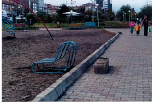
Figure 1. Ahmet Şener Park.

result, availability of measures to alleviate such action in terms of space and equipment is questioned.