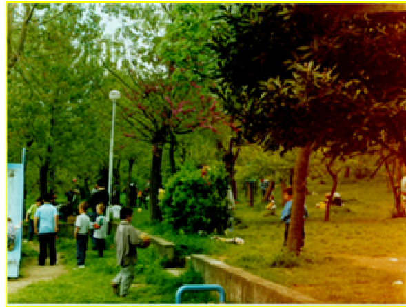
Figure 3. 100. Yil Park.