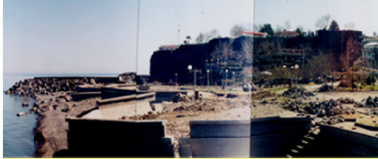
Figure 2. Adnan Kahveci Park.