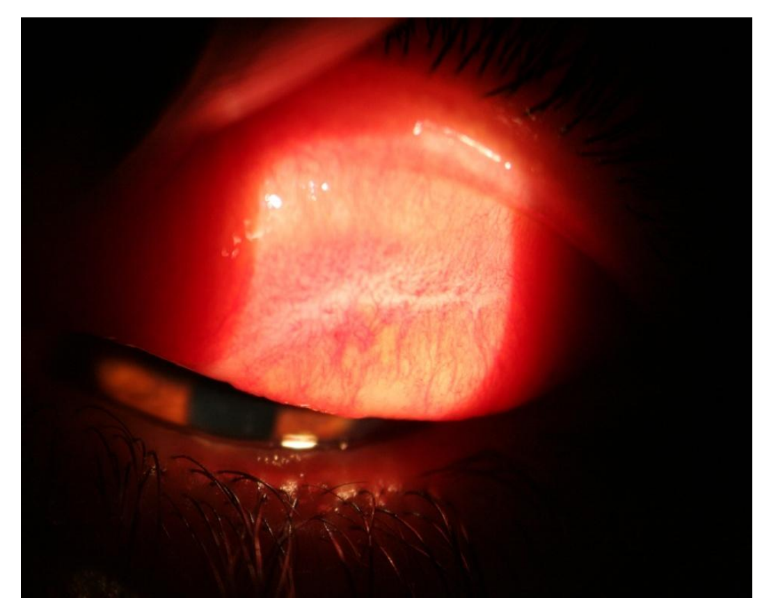
Figure 2. Von Arlet line.