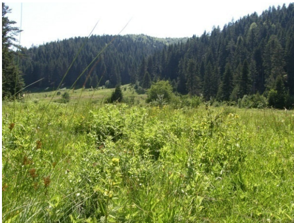
Figure 2. An example from the study areas; Uluyayla.