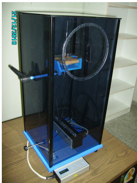
Figure 3. König pendulum hardness.