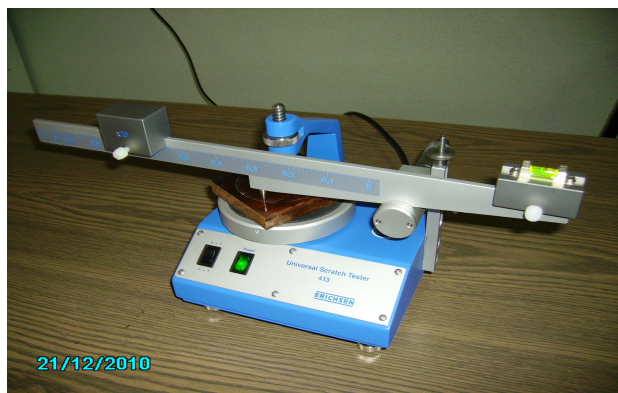
Figure 4. Scratch resistance.

cleaned by brush, considering the recommendations of the manufacturer company. Dye has been applied as 3 layers for boards coated with paper and as 5 layers for board uncoated with paper (Çakicier et al., 2010).