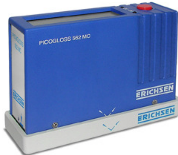
Figure 5. Glossmeter.