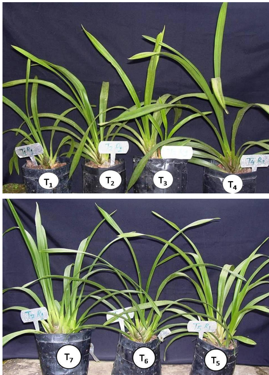
Figure 2. Effect of foliar and media application of panchgavya on growth of Cymbidium hybrid 'Sleeping Nymph'.