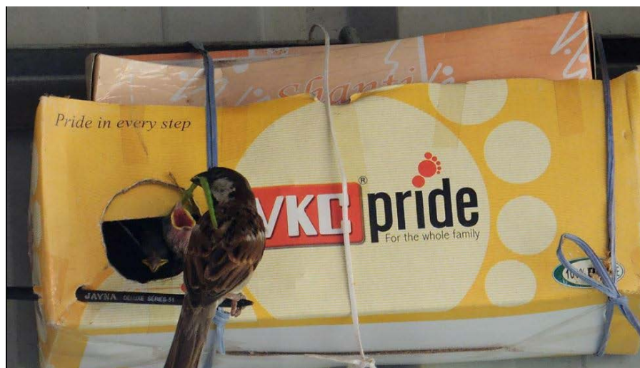
Plate 4. Adult male sparrow feeding the older chicks with plant materials.