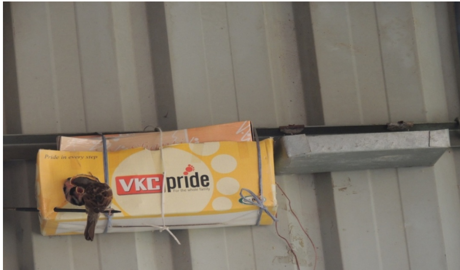
Plate 3. The chicks being nourished by the mother house sparrow.