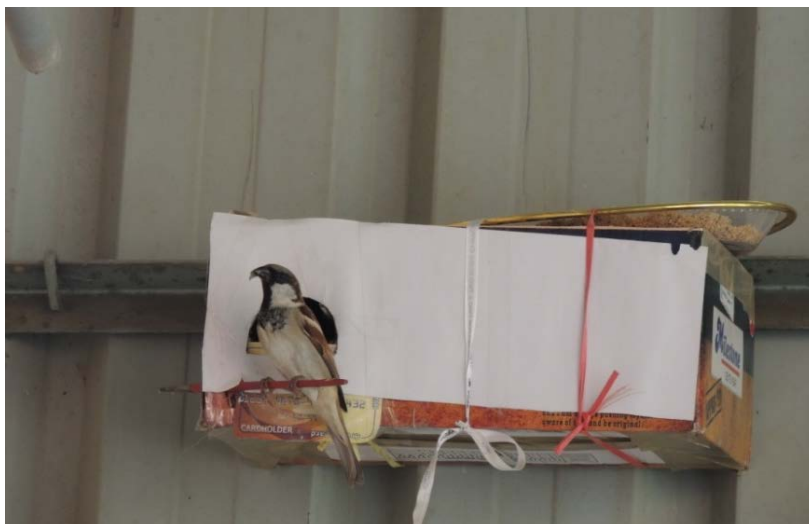
Plate 1. Design of the artificial nest box.