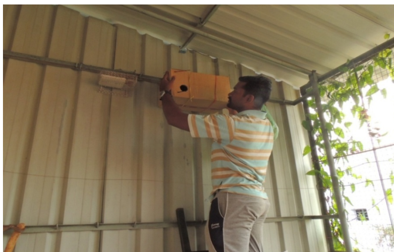
Plate 2. Erection of artificial nest box above 5 feet from ground level.