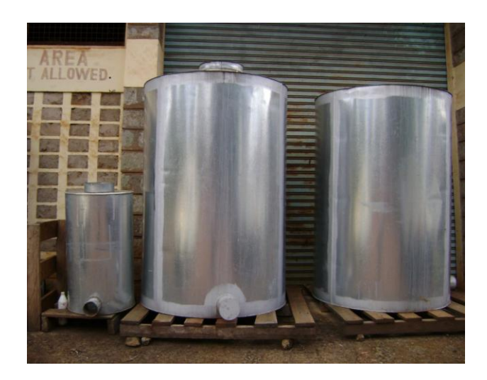
Figure 1. Metal silos.

grains, with an estimated monetary value of more than US$ 2 billion annually and can reach US$ 4billion (Zorya et al., 2011). Post-harvest losses remove part of the supply from the market contributing to food price spikes as was experienced between 2008 and 2011 by (Rosegrant et al., 2015). Postharvest losses also cause resource wastage because natural resources, human and physical capital are committed to produce, process, handle and transport food that no one consumes.