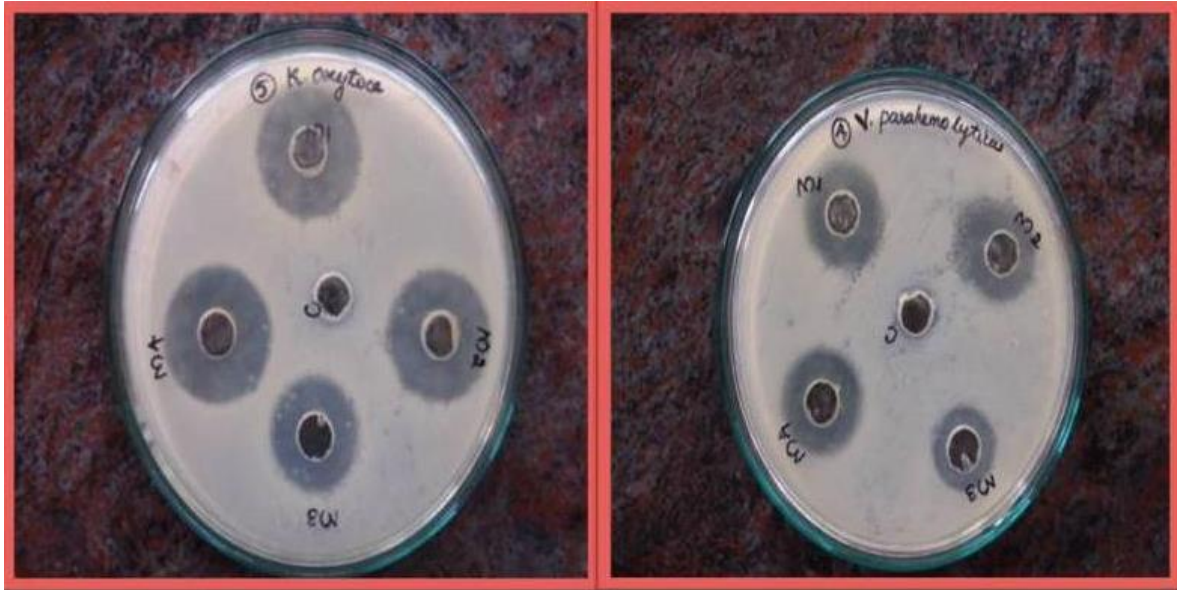
Figure 2. Antibacterial activity of chitosan against clinical pathogens.

antimicrobial activity of chitosan are those causing growth inhibition of microbial cells. Due to its polycationic nature, chitosan molecules interact with anions present around the cell surface making an impermeable layer around the cell and it confines the transportation of vital solutes from all through the cell membranes.