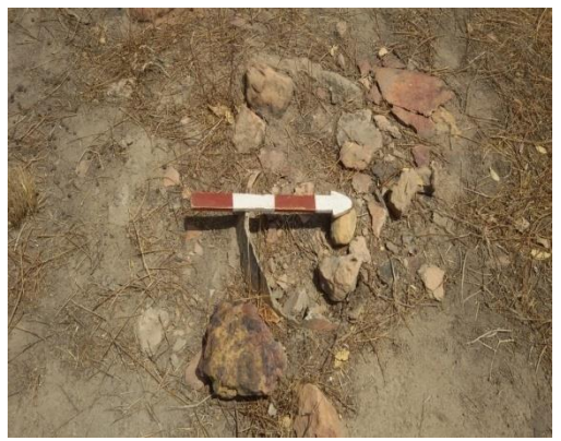
Fig. II: Remnant of Shrine Foundation

once it's out and wet he will assemble his people and inform them about the beginning of the farming season and ask them to set out to their farms as rain is expected at any moment. Contrary to this, even if there was rain throughout a day and night or week but the hoe kept in the shrine is not out, then nobody would be allowed to plant anything on his farm. With the coming of Islam, the present-day people of the area discarded their traditional beliefs and accepted Islam with the belief in oneness of God Allah .