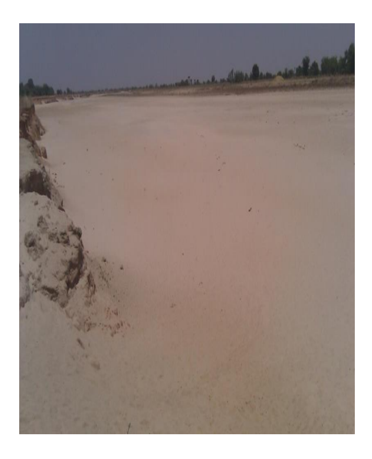
Plate IX: Remains of Defensive Wall