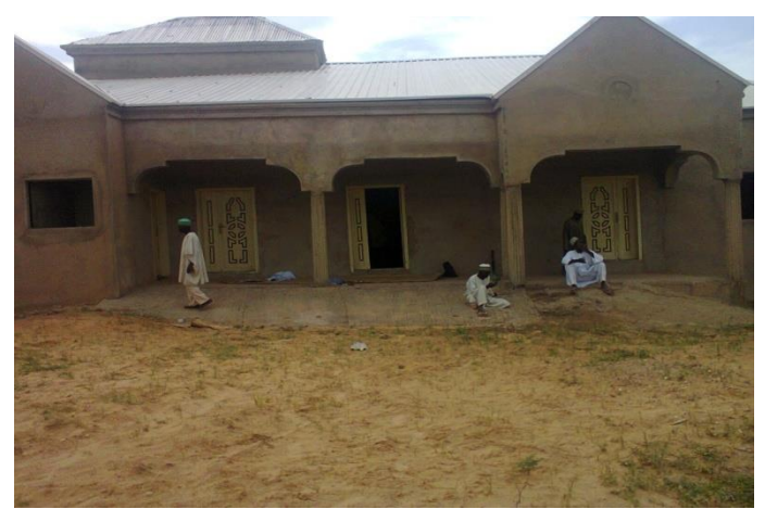
Plate X: Front view of the uncompleted site Museum.

Despite these bodies mentioned above who are suppose to be managers of this site, the site is under threat of human and natural factors as shown in the plates above.