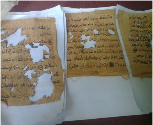
Plate I: Manuscript sent from Yemen

infected by termites and is deteriorating (see plate I and II).