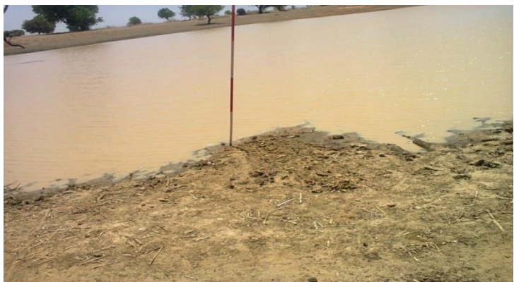
Plate VIII: Pool of Heads (TafkinKanu)

Remains of defensive wall (BazarBirni): the remains of the defensive wall shows that the wall was built with mud though presently washed away by River Rima which flows by its side. Oral information and written documents confirm the names of the seven gates found on the wall namely: Kofar Malam,KofarGaladimaKachiro,KofarKihinBisa, Kofar Sarkin Kabi, kofar Sarkin Kwanni, KofarSarki. KofarBaramaka (Augi 1984. Suleiman, per.com 2014). The ruin of the defensive wall has a height of fifty (50) cm.