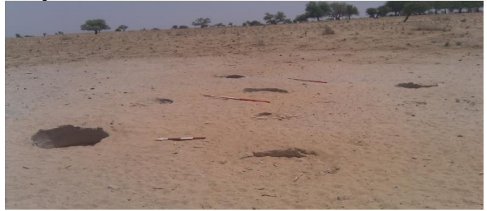
Plate VII: Dye Pits.

about two hundred meters North West of the grave yard. The soil colour of the area differs from other areas as it is whitish and grey. Some of the dye pits are covered with soil. The dye pits range from 0.8 - 1.2m in diameter. The dye pits covers a rectangular area of length 9m by 7m breadth totaling 63m^2 . The clustered dye pits are about two hundred and sixty-six meters (266m) north west of the grave yard.