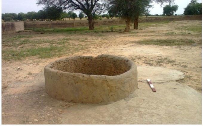
Plate VI: The well in the grave yard