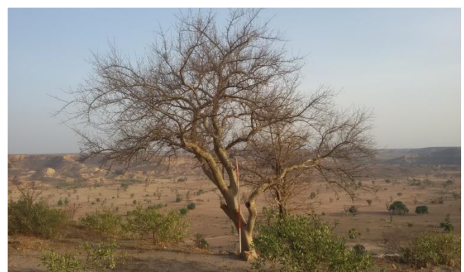
Fig. III: Aerial shoot tree (Gorom)

The community or village head (Moi) of Ndokto Fara is nominated or emerged based on consultations among the elders of the community and this has been in practice up to the present. According to oral information (Abdulmumini, Pers. Comm., 2015) a leader emerged from the royal family after a series of meetings and consultations among the elders. When a consensus is reached among the princes, the name of the qualified candidate would be sent to the district head in Fika for final approval and confirmation. According to this tradition, four pre-Islamic rulers ruled for several years including the first leader Moi Yava Kanji, Moi Ma'aji, Moi Anga and Moi Langawa. The number of years they spent on the throne was not disclosed. The Islamic leaders include Moi Bazam who ruled for 80 years, Moi Doya, Moi Kakau seven years, Moi Boyaya 23 years, Moi Shua'ibu Haruna 14 vears and Moi Alhaji Abdulmumini 1993 to date.