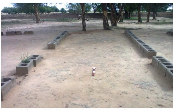
Plate IV: Bawa Jan Gwarzo's grave