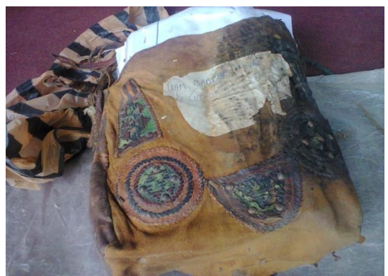
Plate II: The Gaffaka in which the Manuscript is preserved

• Archaeological Reconnaissance: The ground reconnaissance method was employed in this research. The reconnaissance involved