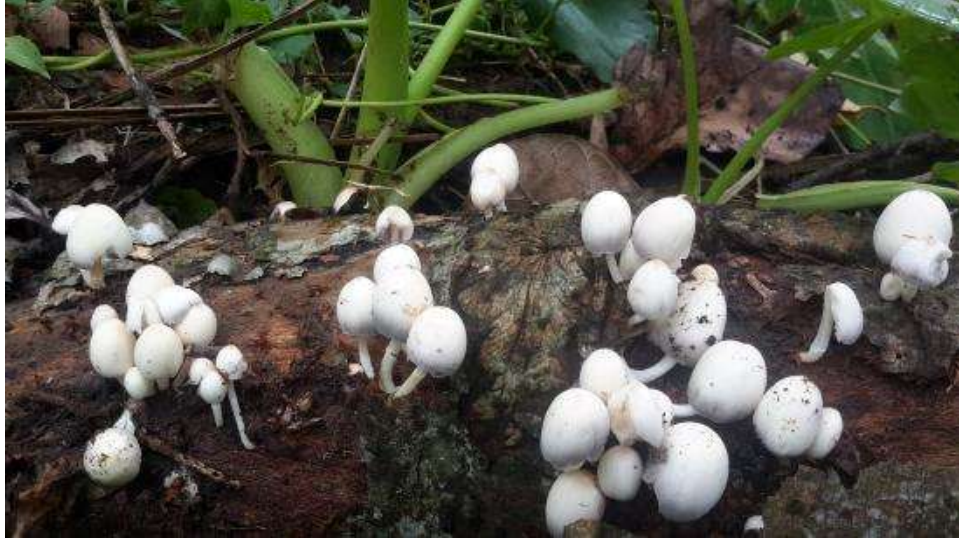
Figure 2. A picture of the local mushroom variety.

bisporus ) and Oyster ( Pleurotus species) are the two main commercially produced mushroom varieties in Kenya. A three square meter plot of land can produce up to 1,000 mushroom sets in small polythene bags. Harvesting can be done fortnightly with a kilo of mushroom going for as much as 800 Kenyan shillings. Use of idle structures, production all year round the first harvest being 28 to 35 days after planting the crop, use of agricultural waste as substrate and its ability to biodegrade offers opportunity for its production and this provides a more economical and environmentally friendly disposal system (Figure 2) (Isikhuemhen et al., 2000).