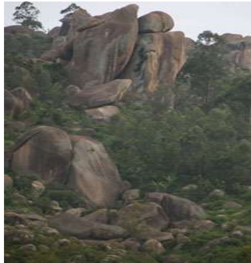
Figure 1. A picture showing the rocky terrain and steep landscape in Vihiga County, Kenya.

Opportunities may arise, to significantly improve up an existing but considerably small activity, in response to a sudden change in circumstances. Developing more generic livelihood skills together with the provision of generic business services will improve individual abilities to identify and seize new livelihood opportunities in a range of sectors (Gordon et al., 2010). Household level diversification has implications for rural poverty reduction policies because the conventional approaches aimed at increasing employment, incomes and productivity in