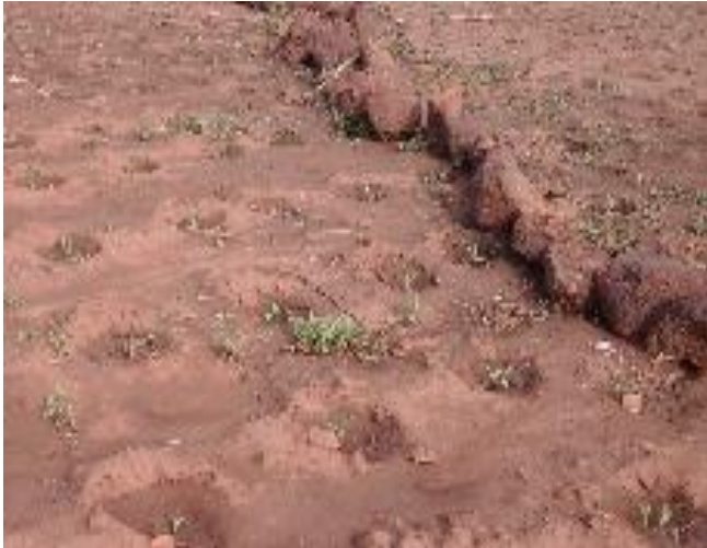
Figure 2. Stone row combined with zaï pits.