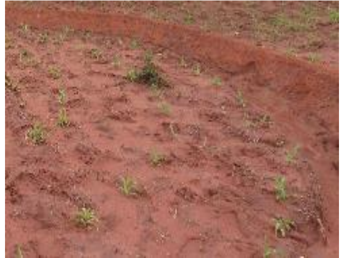
Figure 4. Earth bund built on contour line.