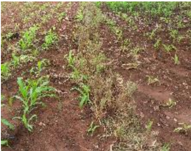
Figure 3. Grass strip built on contour line.