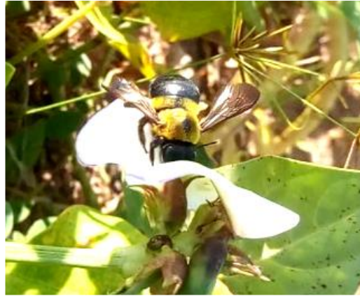
Figure 1. Xylocopa olivacea harvesting nectar on Vigna unguiculata flower.