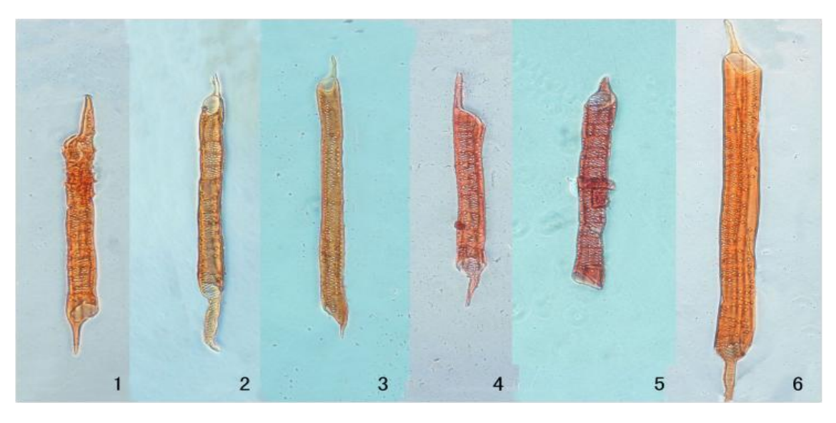
Figure 2. The reticulate vessel element shape of xylem of branches from different cultivars: 1, ' Fuji ×' Telamon ' normal apple; 2, ' Gala '×' Telamon ' normal apple; 3, ' Fuji . 4, ' Fuji ×' Telamon ' columnar apple; 5, ' Gala '×' Telamon ' columnar apple; 6, ' Telamon '.

cultivars, and cultivars 4, 5 and 6 were columnar cultivars.