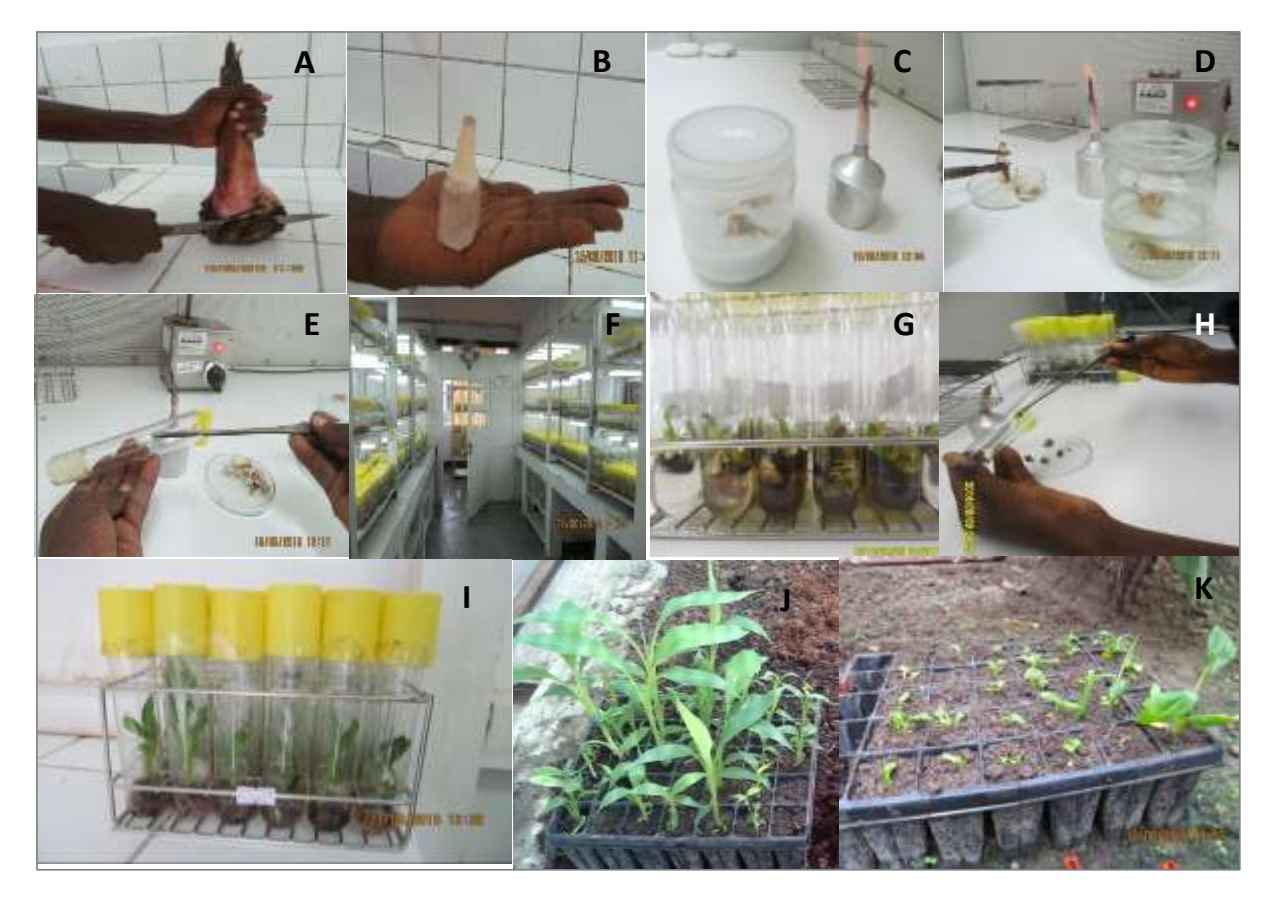
Figure 3. Stages of cultivation. A: Removal of all old non-meristematic tissues. B: Explant with reduced size and washed under running water. C: Disinfection successively by immersing the explant in alcohol 70% for 15 s, and the solution of calcium hypochlorite 30% for 20 min. The explant is then rinsed with sterile distilled water three times. D: Removal of the foliar tissues one after the other until extraction of the meristematic apex. E: Putting the explant in the in vitro culture medium. F: Transfer of tubes containing the explants into the culture chamber. G: Proliferation of the buds after a minimum of two weeks. H: Subculture (separation of buds and their transfer to a new medium). I: Regeneration of buds to rooted seedlings. J and K: Transfer of vitro plants to pots.