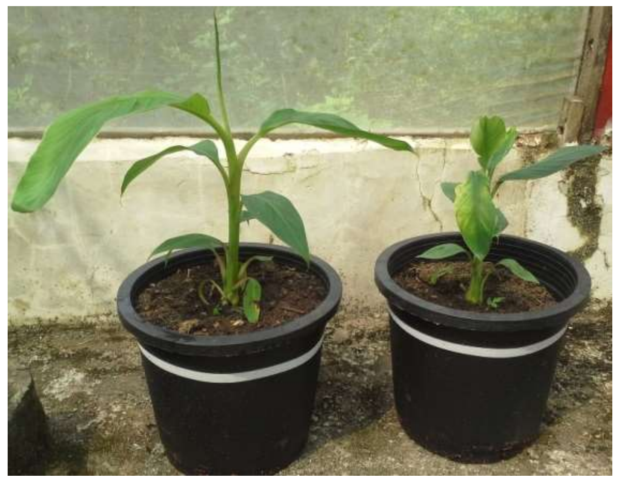
Figure 5. Banana bunchy top virus-free plantlet (left), and infected plantlet (right).

Table 1. Health status of Libanga Likale and Litete after in vitro culture.