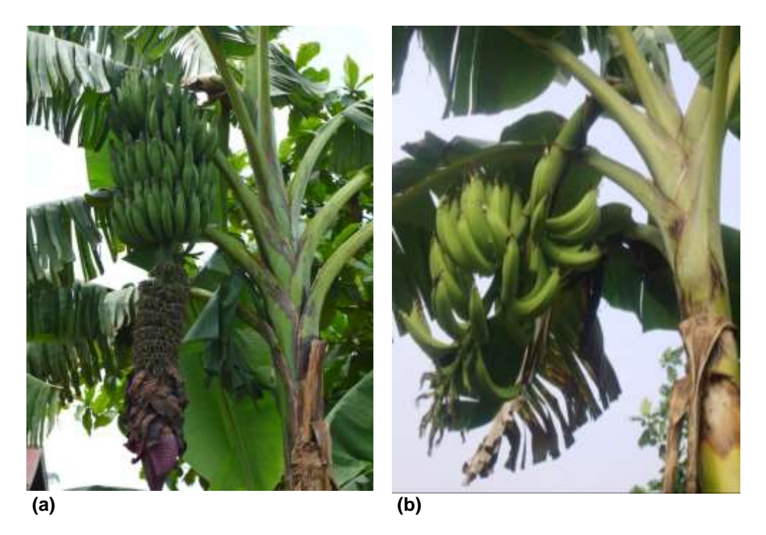
Figure 1. Cultivars used for in vitro culture (a) Litete and (b) Libanga Likale.