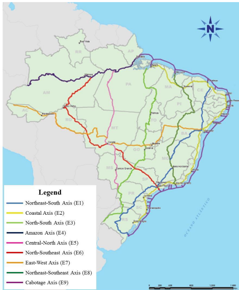
Figure 2. Structural Axis proposed by Projeto de Integração Nacional from the federal government, Brazil.

country are more debated, with the aim to boost its insertion into globalization. Therefore, the establishment of a set of national objectives that would make the country more competitive in the global scenario is of extreme importance for the success in international trade (Caixeta Filho, 2010).