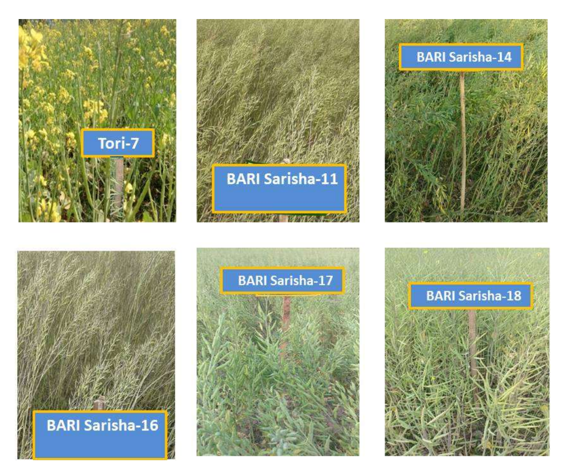
Plate 1. Pictorial presentation of different potato varieties during study period.

variety J-5004; which was identical with the variety Tori-7. The lowest number of siliquae plant<sup>-1</sup> (45.9) was found in the variety SS-75. Similar result was also found by Hossain et al. (1996) (Plate 1). Nutrient uptake as well as water uptake is severely hampered due to osmotic imbalance of the saline soil solution. Nutrients and water are essential to develop morphological and yield character of the plants. Uptake of low input reduces the photosynthesis process and ultimately prevents the proper translocation of carbohydrate to form the yield contributing characters (Zaman et al., 2015; Cruz et al., 2018).