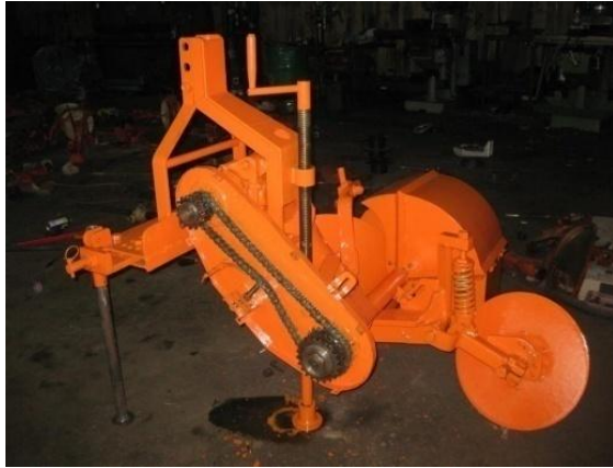
Figure 3. Transmission system.