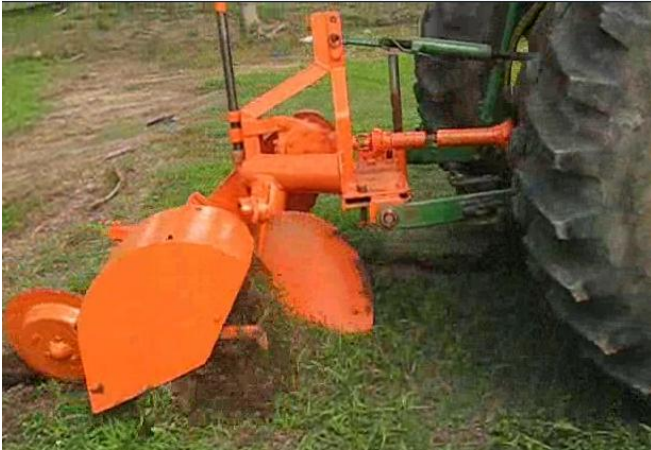
Figure 1. A comboplough.