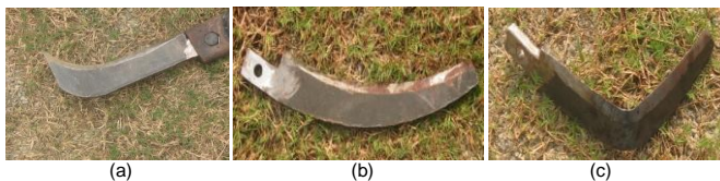
Figure 2. Straight blade, S (a), C-shaped blade (b) and L-shaped blade (c).

properties, tool parameters and cutting speed (Zhong et al., 2010). The cost and the timeliness of operation assume critical importance while deciding the type of tillage tools. Godwin (2007) said that the cost of tillage operation is a vital component to determine farm profitability and recent years have seen a significant move to reduce tillage operation. The great part of energy consumption in mechanized agriculture is related to tillage operation. Operations simultaneously utilizing two or more different types of tillage tools or implements to simplify, control or reduce the number of operations over a field are called combined tillage. Machines for tillage operation usually pass the farm four times or more which causes soil compaction, increases cost of labour and energy. The compression of soil causes reduction of the moisture penetration, soil oxygen capacity, penetration of root in the soil, organic materials capacity in soil and increasing energy consumption (Tebrügge and Düring, 1999).