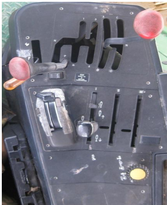
Figure 4. Adjustment and positioning of tractor travel speed.

63.4 kW John Deere 6405 (PTO power 51 kW) was used for the tillage experiments. The tractor has static weight distribution of 40% front and 60% rear with total mass of 3891 and 180 kg balancer (6 × 30 kg). The front tires were type radial 12.4 to 24 single operated at 220 kPa inflation pressure while the rear tires were radial 18.4 to 34 single operated at 160 kPa inflation pressure.