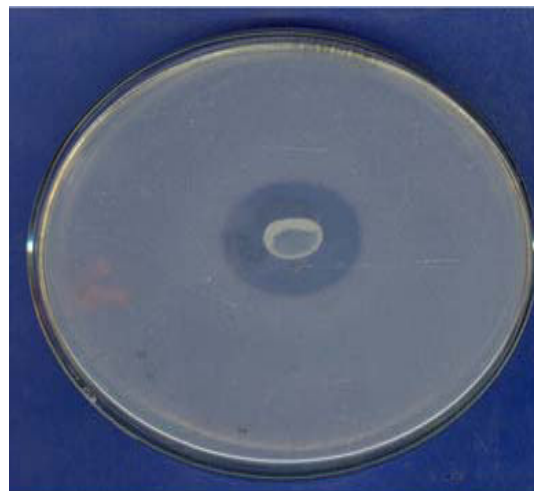
Figure 1. Halos formation around the colony of PSB.

Our findings of IAA production in PSBs isolates are in agreement with those of other researchers. These isolates varied greatly in their intrinsic ability to produce IAA.