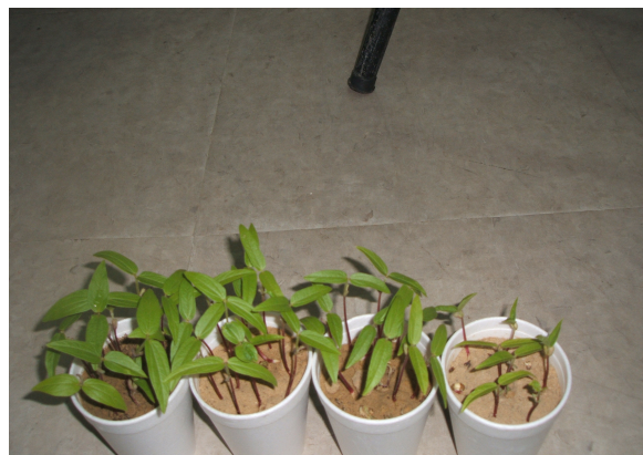
Figure 2. Growth promotion of mung beans by PSBs.

Productions of IAA and phosphate solubilization by the PSBs were examined as possible contributing factors of mung beans growth promotion. Tests for production of the auxin IAA were positive for all test stimulant strains, suggesting a potential mechanism whereby these bacteria may regulate plant growth. This interpretation is in line with the well-known characteristic of certain phytohormones (e.g., auxin, ethylene). Induction of longer roots with increased number of root hairs and root laterals is a growth response attributed to IAA production by other rhizobacteria,