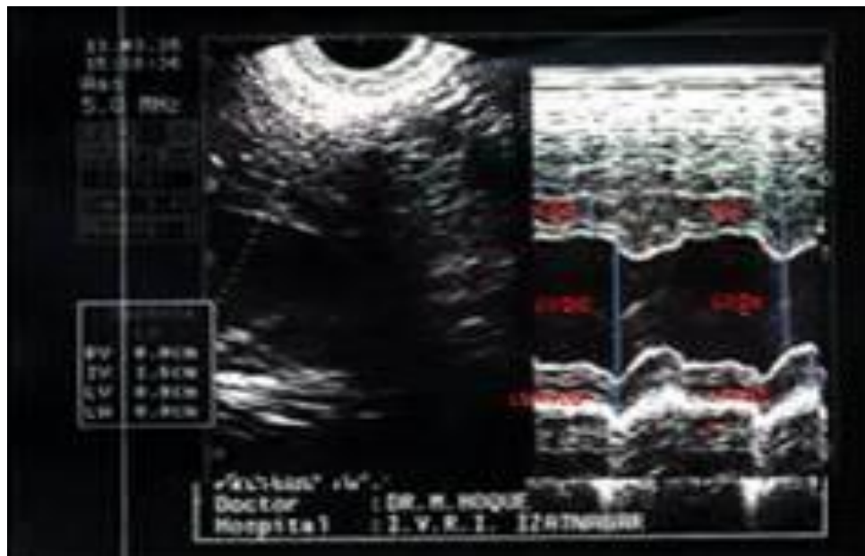
Figure 3. Measurements of left ventricular structures during systole and diastole (LVDd,s-left ventricular diameter during diastole and systole; IVSd,s - interventricular diameter during diastole and systole; LVPWd,s - left ventricular posterior wall during diastole and systole).

kW(1/3)). Use of these indices circumvented undesirable statistical characteristics inherent in linear regression of echocardiographic dimensions against body weight and, to a lesser extent, body surface area. Compared with the regressions, ratio indices resulted in substantial refinement of the predictive range for each M-mode measurement in dogs, particularly with decreasing body size.