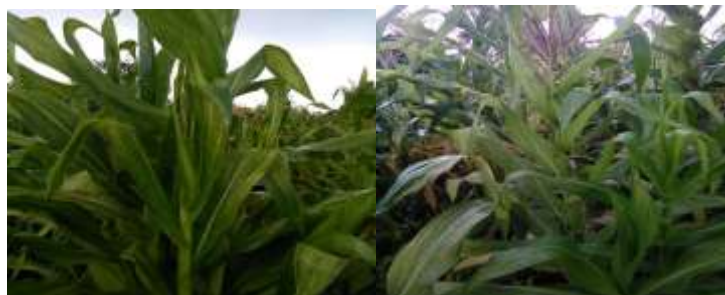
Figure 1. A popular maize hybrid, BH540, highly infected by MSV on farmers' field in Benishangul Gumuz, Western Ethiopia.

marker assisted selection (MAS) (Pratt et al., 2003; Nair et al., 2015). One of CIMMYT's elite inbred lines, CML202, is known to harbor this gene (Welz et al., 1998). This inbred line is well adapted to the Ethiopian condition; and is in the pedigrees of two high yielding drought tolerant hybrids (BH546 and BH661). CML202 can, therefore, be used as a potential source of resistance for introducing the gene into the susceptible germplasm using MAS.