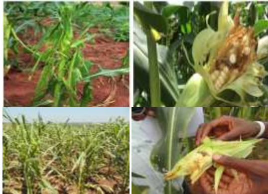
Figure 2. Picture showing typical damage by fall armyworm on maize.