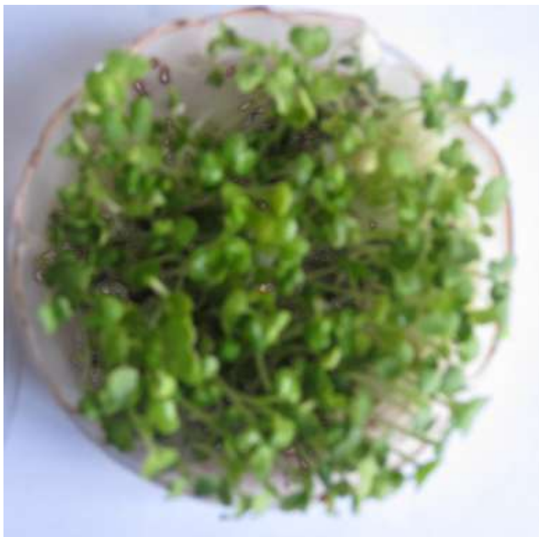
Figure 4. Germination of nappa cabbage. The seeds showed a vigorous germination.