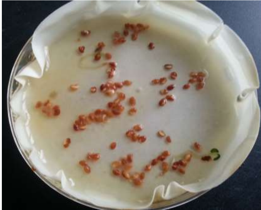
Figure 1. Germination of alfafa: 3-5 germinations among 100 seeds were observed.