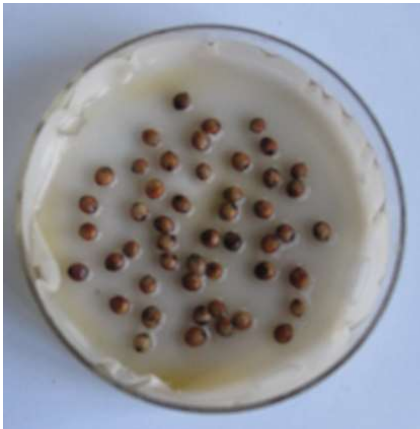
Figure 2. Germination of sorghum hybrid. Seeds did not decay but there was no germination.