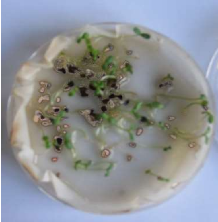
Figure 3. Germination of garland chrysanthemum. The seeds showed good germination.