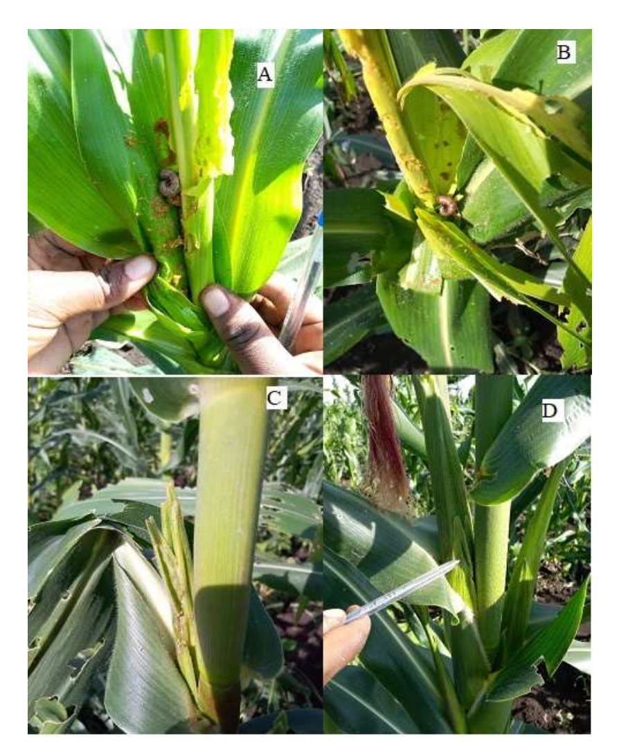
Figure 2. A-FAW larvae on one of the plants surveyed in Buwekanda, B- Larva on one of the plants surveyed for FAW damage in Buwabwala, C- Maize plant ear destroyed by FAW larva in Buwekanda and D-Maize plant ear damaged by FAW larva in Buwabwala.

methods we employed as we surveyed the farmers' fields and collected the larvae in determination of the incidence. This is supported by Grzywacz et al. (2014), who asserts that low-cost options of pest control which build on indigenous knowledge and ecological options are more relevant to smallholder farmers.