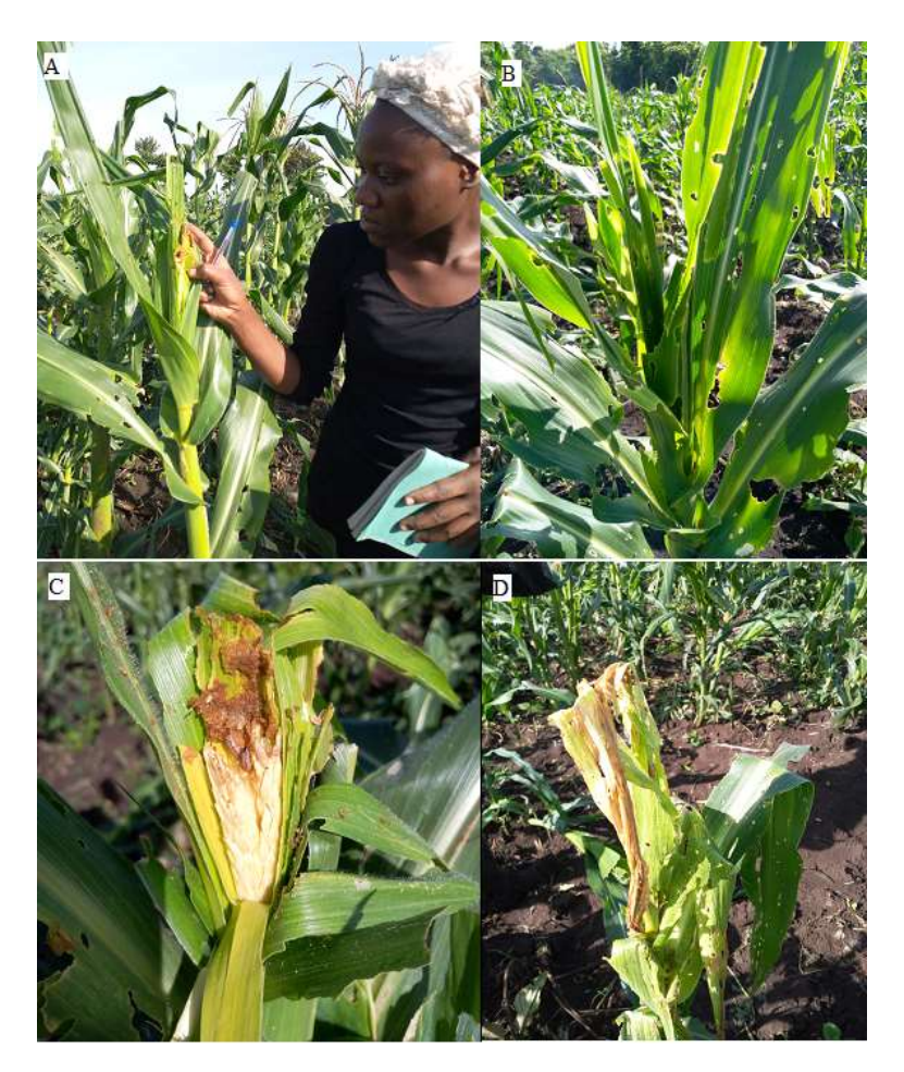
Figure 1. A-Inspecting FAW damage on maize plant, B-Field infested with FAW, C- Maize tassel destroyed by FAW and D- Plant leaves drying because of extensive FAW damage.

maize plants from Buwekanda parish had ears damaged by the FAW and 177 plants from Buwabwala had ears damaged by the FAW. The damage on the ears had different severity scores as described by Davis and Walliams (1992). The severity of FAW damage on the ears in the two parishes were different and these differences were statistically significant (df = 9, \chi 2 = 299.2, P = 0.000*) (Table 2 and Figure 2).