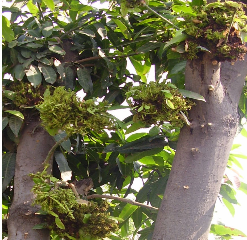
Figure 1. Malformed heads hanging on mango tree.