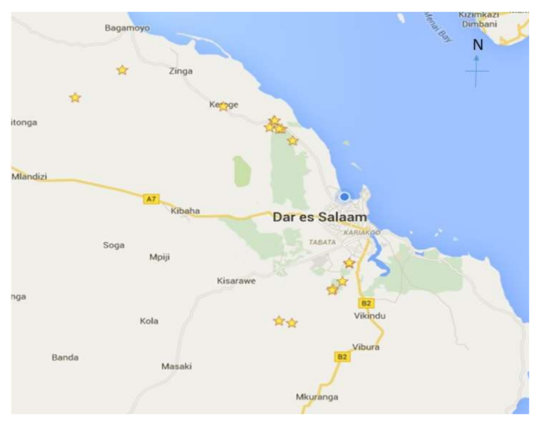
Figure 1. Locations of cucurbit gardens from which samples were taken. The exact points are shown as stars on the map.

method. However, incidence of viruses computed after obtaining laboratory results are either shown per crop or plant for a given or all viruses and was computed as the number of plants confirmed by ELISA test to be infected divided by the total number of plants for the crop or wild plant under consideration.