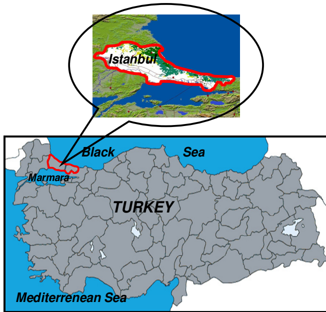
Figure 1. Study Area: Istanbul.