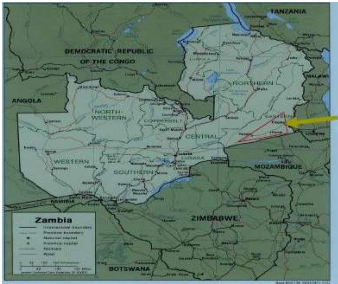
Figure 1. Map of Zambia showing the study site of four districts in Eastern Province of Zambia.

influence adoption of improved fallows and biomass transfer more than other factors do. Each of the other factors' influence account for below 20% each.