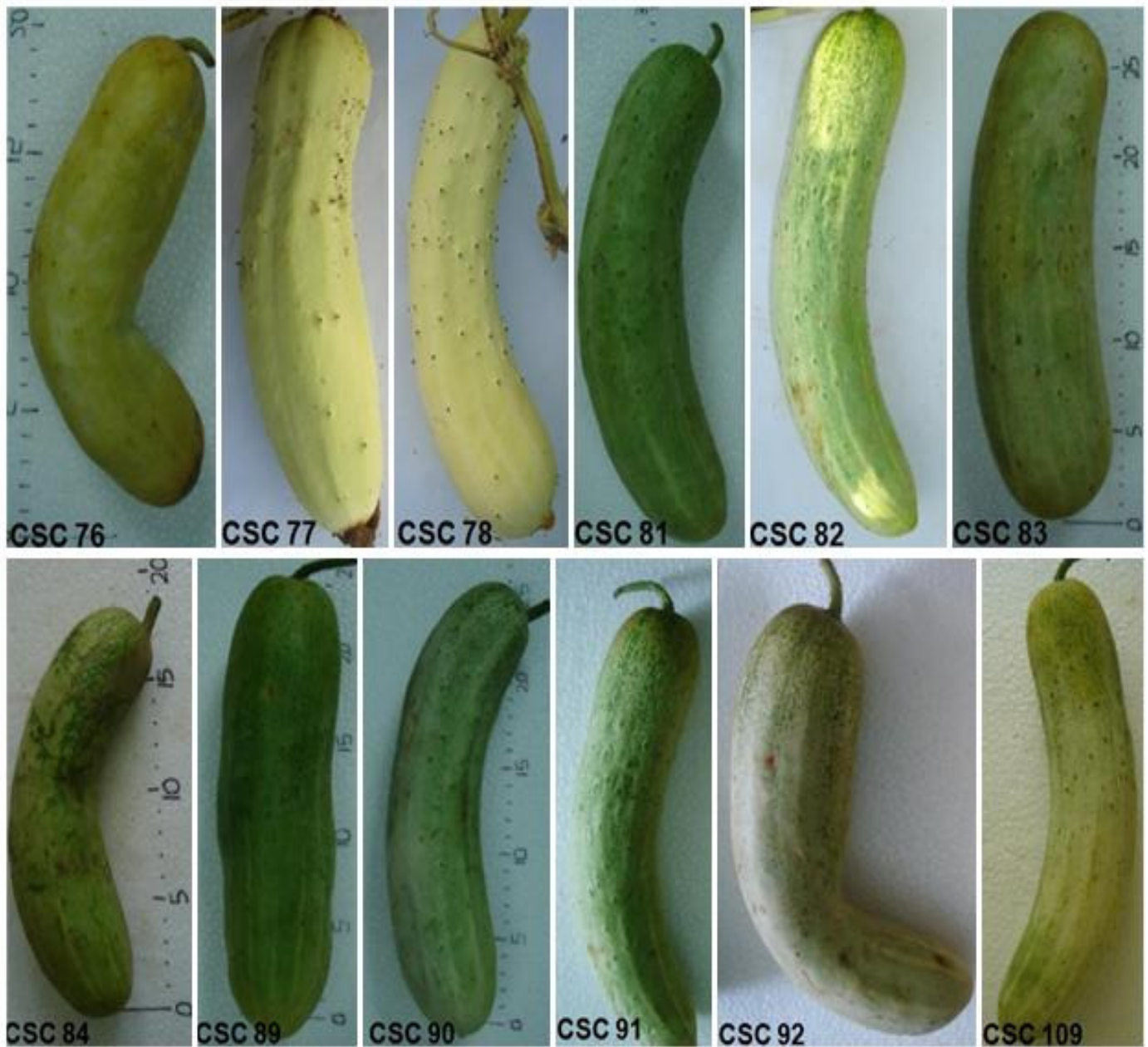
Figure 1. Continued.

collections to be stressed for further breeding purpose. To determine whether the collections had disease resistance against powdery mildew, 30 collections were tested against two STS primers which were specific to powdery mildew QTL of cucumbers (Sakata et al., 2006). A total of 13 collections showed gene specific resistance against the powdery mildew. 7 collections showed amplification against the primer EAAGMCAT280-282STS with a band size of 229 base pair and 9 collections showed a band size of 140 base pair against EAACMCAC391-395STS primer (Table 1). CSC-04, CSC-76 and CSC-77 showed banding in both primers. These two primers were