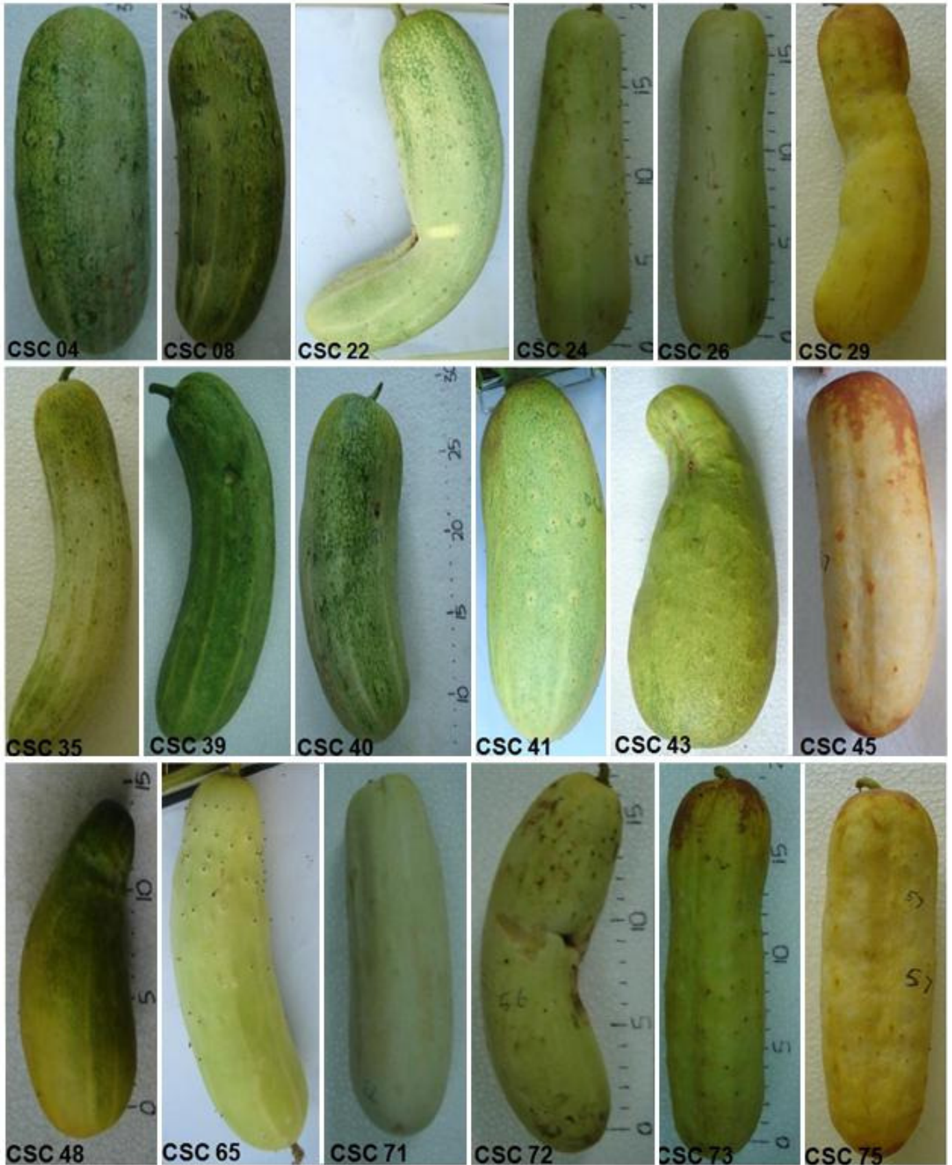
Figure 1. Diversity of fruit size, shape and color of C. sativus collections collected from Karnataka, India.