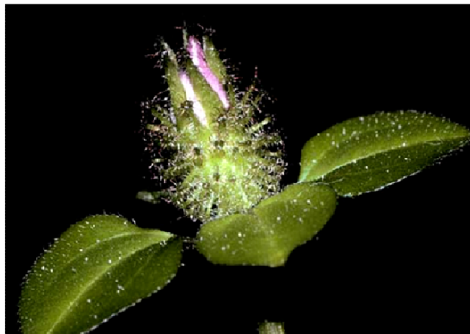
Figure 1. Dissotis rotundifolia Triana.