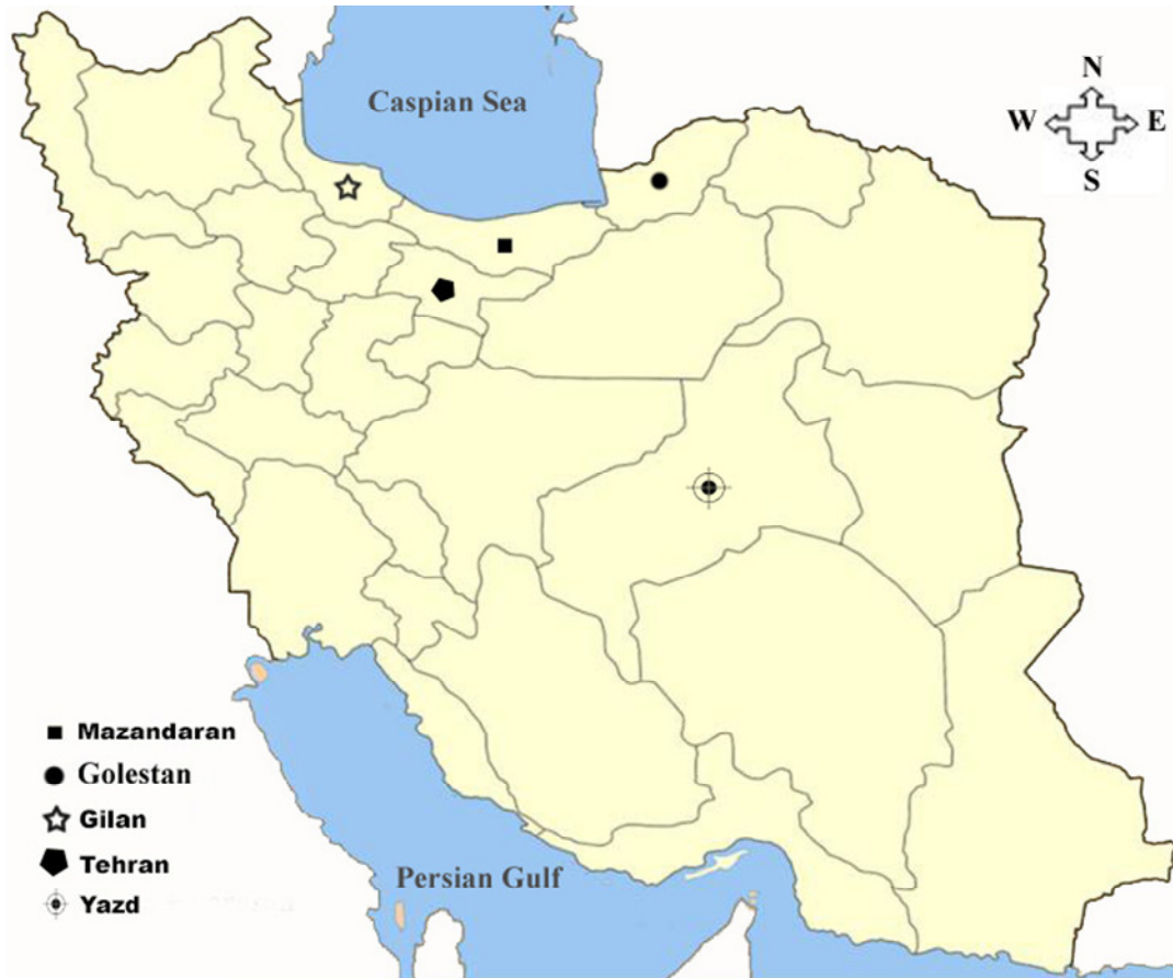
Figure 2. Geographical location of the Caspian horse population sampled in the present study