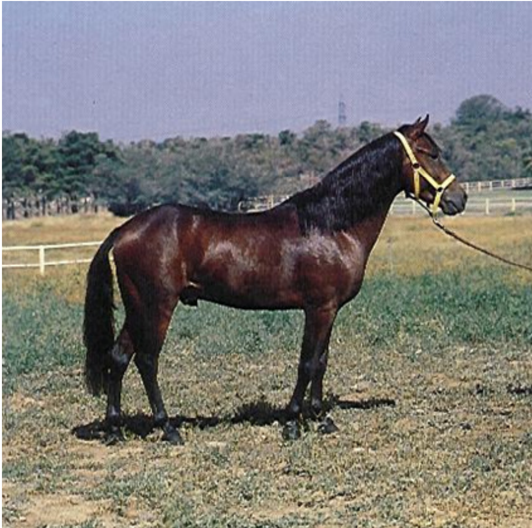
Figure 1. A typical Caspian horse.

markers such as microsatellites have proved to be useful in clarifying population structure and evaluating genetic diversity (Marletta et al., 2006; Plante et al., 2007; Avdi and Banos, 2008). The present study was undertaken to genetically evaluate Caspian horses for genetic variability and to assess whether they have experienced any recent genetic bottlenecks based on the analysis of microsatellite markers.