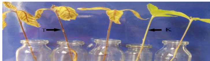
Figure 1. The symptoms of chestnut leaves treated with Cp-toxin. T = Treatment and K = control.

plasmalemma. The main objective of this study was to examine the ultrastructure and physiological changes of chestnut leaf cells induced by Cp-toxin. For this purpose, MDA content and EL were measured, and the ultrastructure differences of leaf tissues between resistant and susceptible cultivars treated with Cp-toxin at different concentration were observed.