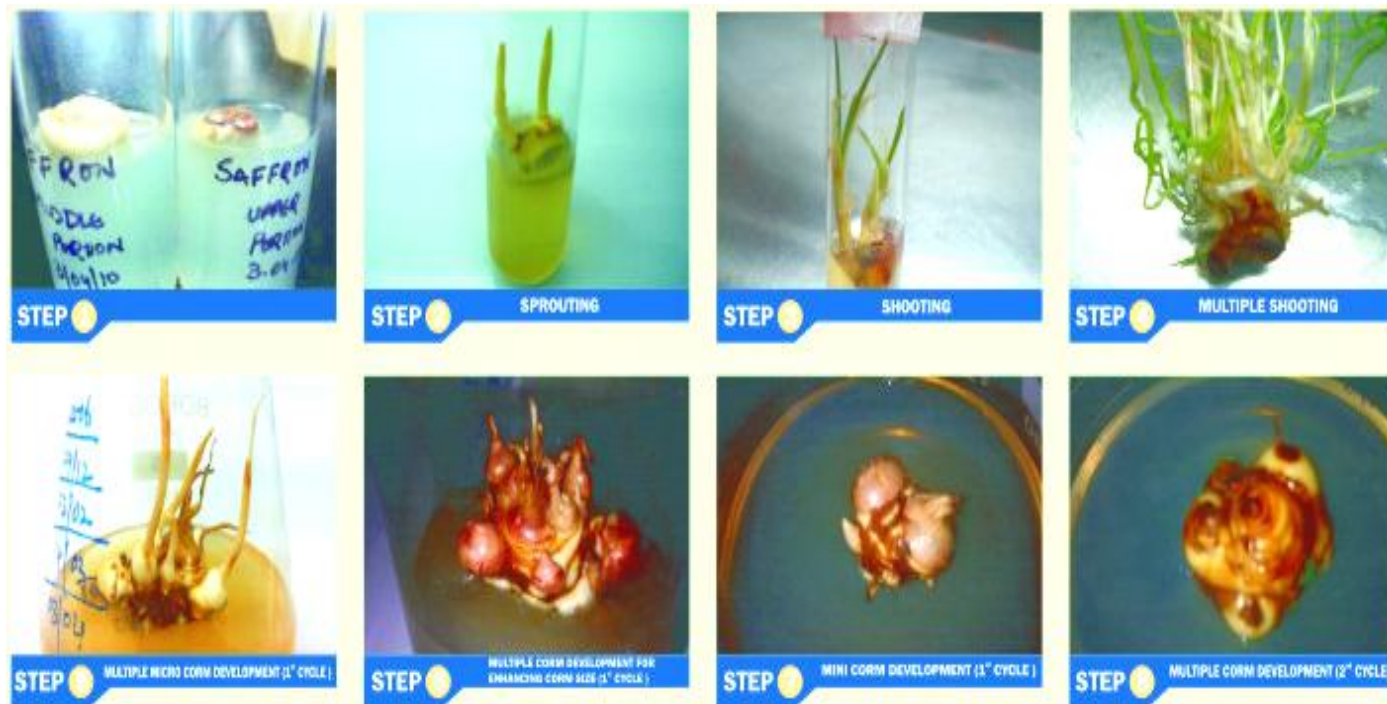
Figure 2. Stages of in vitro corm production.