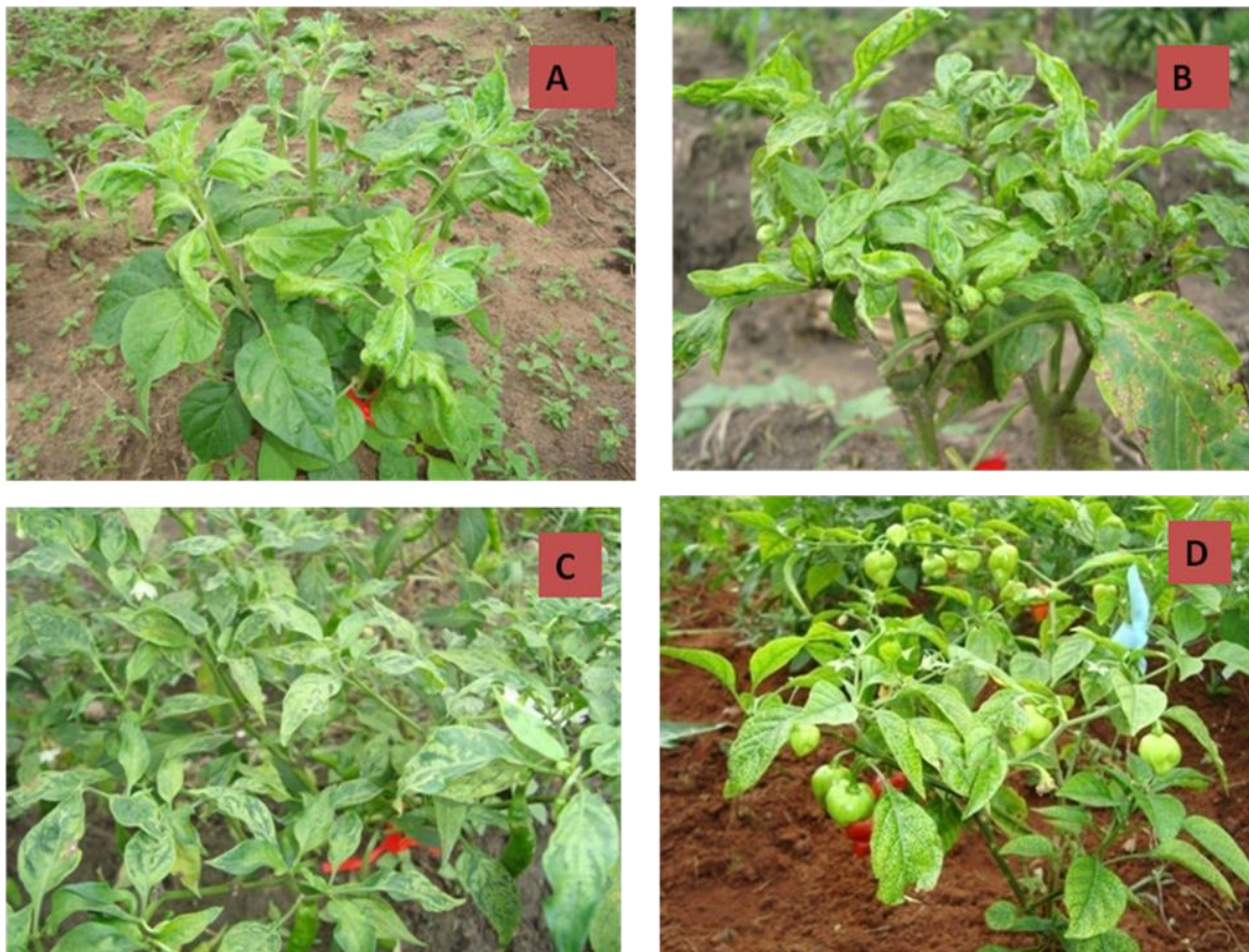
Figure 1. Viral disease symptoms observed on pepper in the farmers' fields. A= Sweet pepper plant infected with PVY, PVX, CMV and TEV; B= Hot pepper plant with CMV, PVY, PVX, TEV, PVMV, ToMV, TMV and PMMV; C= Long cayenne plant infected with PVY, PVX, PMMV, CMV and TEV; D= Hot pepper plant infected with PVY, PMMV, CMV and TEV.

and severity of infection varied significantly depending on the location. In general, the disease incidence was highest in Ekiti state (96.67%) in 2010, while Oyo had the least (66.90%) (Table 1). Ondo had the highest incidence in 2011 with 91.67%; followed by Oyo state with 80.17%, Osun had the least with 65.17% (Table 2). The south-west agro-ecological zone of Nigeria had an average disease severity score of 2.9 during the 2010 surveys and 2.8 in 2011. The disease severity was highest in Osun (average severity score of 3.1), closely followed by Ekiti (3.0). The lowest level of disease severity was recorded in Lagos state (2.6) during the 2010 surveys (Table 1). As for incidence, disease severity was highest in Ondo (3.3), followed by Oyo (2.9) during the 2011 surveys (Table 2).