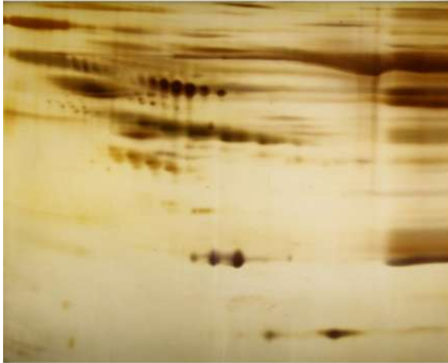
Figure 1. Two-dimensional pattern of human serum proteins in IPG (pH 4-7 and 18 cm) via cup-loading sample application, stained with silver.

principally is based on the two-dimensional gel electrophoresis to separate proteins and mass spectrometry for protein identification (Steven et al., 2000). 2-DE, the first step in proteomics, separates proteins based on their isoelectric points and molecular masses (Dorri et al., 2009; Mi et al., 2011). To date, several versions of 2-DE that was first reported by O'Farrell in 1975, have been published (O'Farrell, 1975; Issaq et al., 2008).