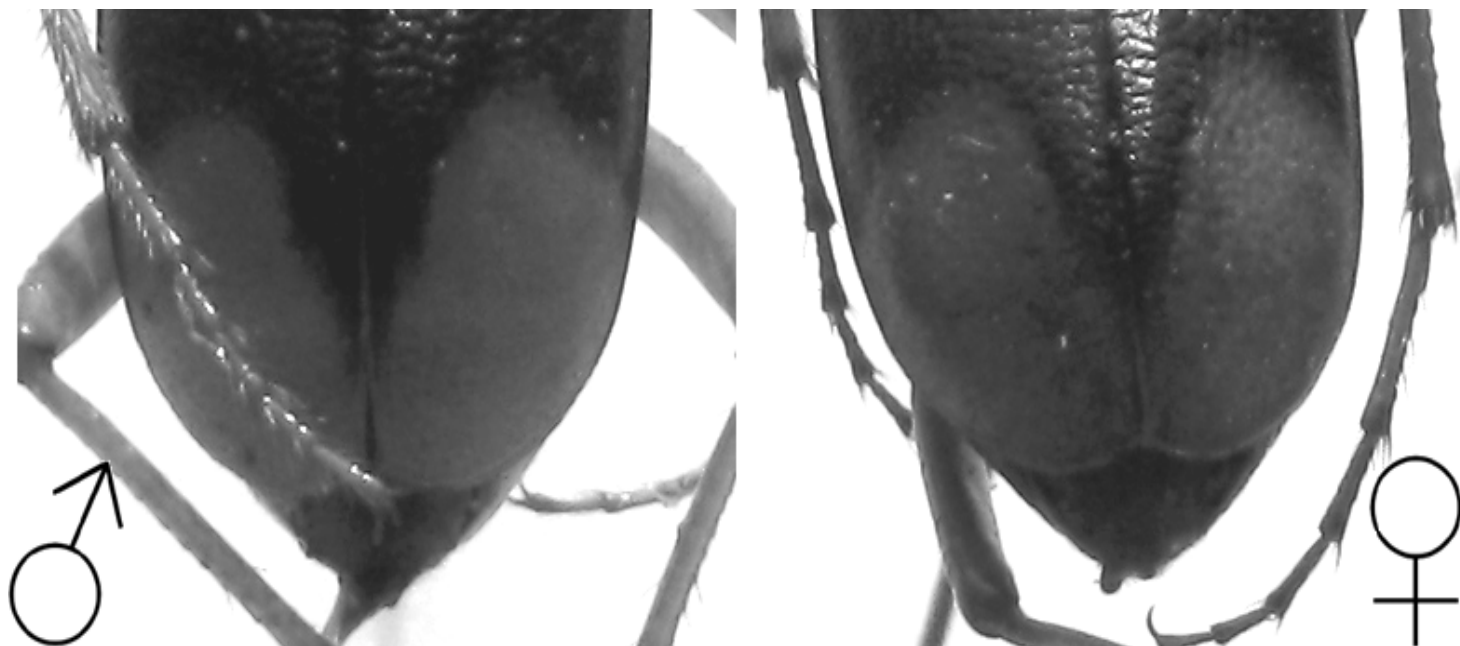
Figure 1. Maculations at the tip of elytra of M. euphratica euphratica with a resemblance of a heart in shape.

province). The body size was measured using 79 individual species collected from Izmir, Mersin and Adana provinces in 2001 and 2010 taken from IBM "Insect Bio-diversity Museum" in Atabey, Isparta province. Besides, some biological features, like life table, of M. euphratica euphratica were also given under laboratory condition ( 30 \pm 3^\circ\text{C} ) for the first time ( n = 20 ). During the life table study, night butterflies (frequently caught by members of the Noctuidae family by the sweeping method in the campus area of Çukurova University) were commonly given to tiger beetle as food. Life table was prepared from the observed survival and fecundity (progeny production) rates. The intrinsic rate of natural increase was calculated with the following formula (Birch, 1948):