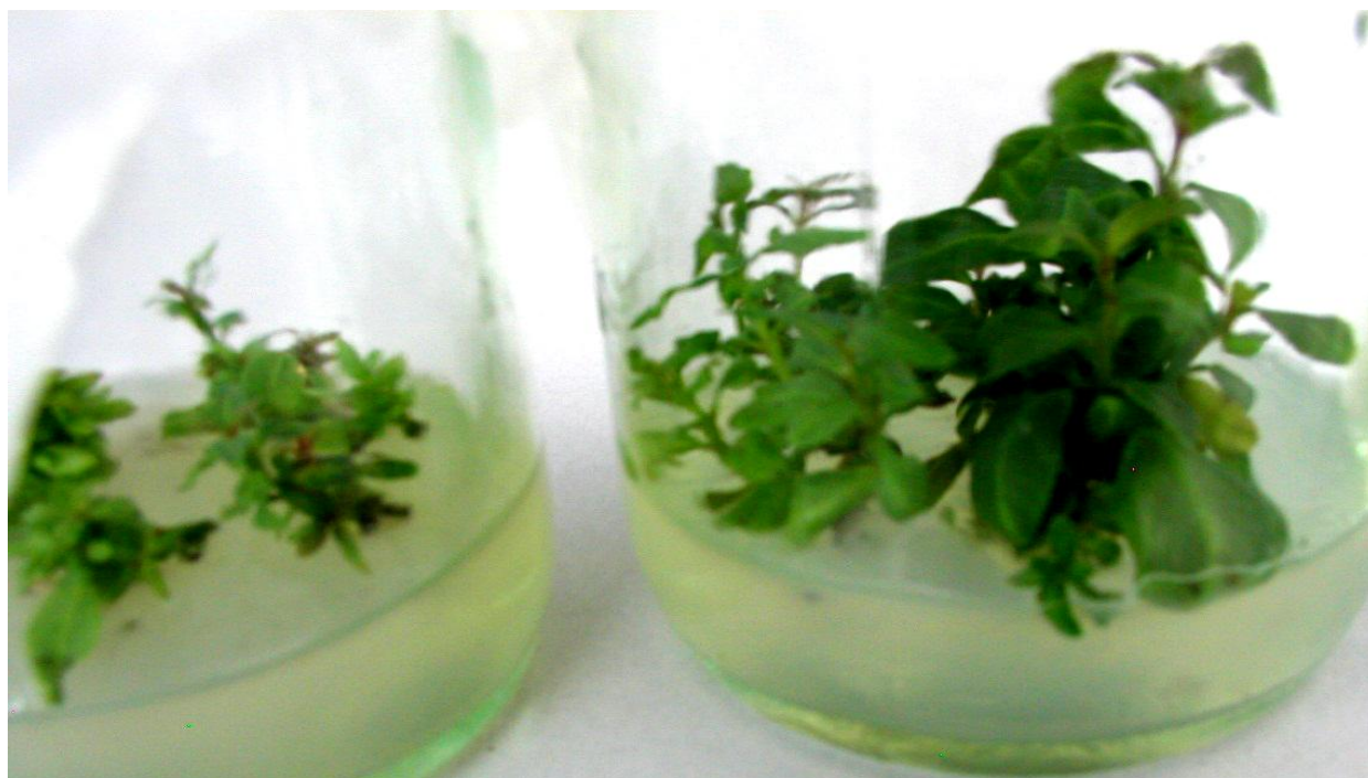
Figure 1. Eucalyptus globulus plants and the ones treated by colchicine. Note: Plants in the left bottle were Eucalyptus globulus and plants in right one were the Eucalyptus globulus polyploid.

of colchicine had the greatest effect of the stimulation and the rate of mutation was highest. Because of the highest mortality rate (60%) at the concentration of 0.5%, taking into account the induced efficiency, higher concentrations were not been conducted in the experiment. Hence, a combination of 0.5% colchicine and treating multiple shoot clumps for 4 days was the most appropriate condition for E. globulus polyploidy induction.