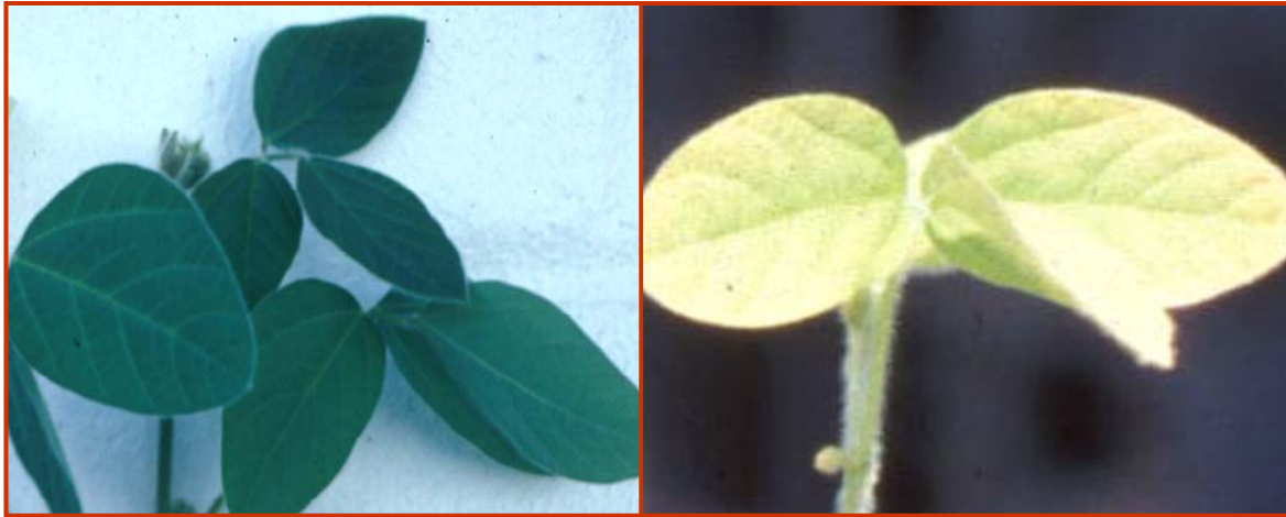
Figure 1. Differences in leaf color indicating differences in N_2 -fixation effectiveness among early juvenile soybean plants grown in nitrogen-free medium inoculated with a cowpea type rhizobial strain IV.