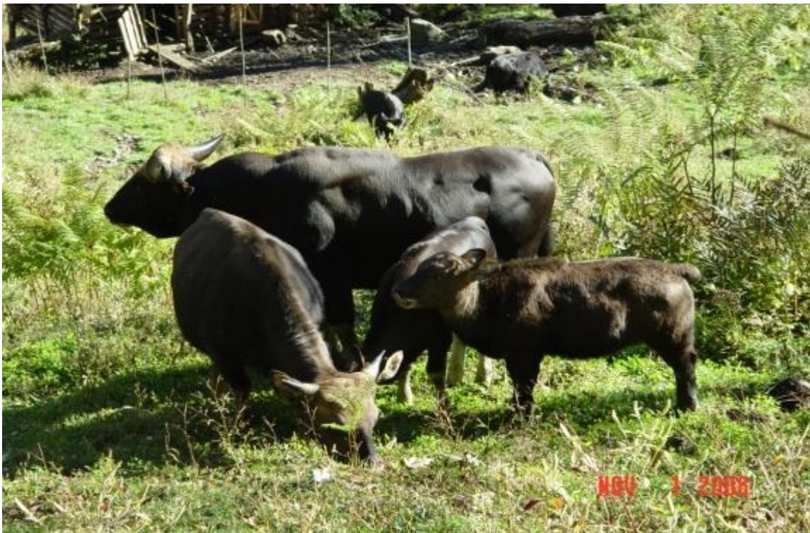
Figure 1. Grazing mithun population in Phoenix Mountains, Yunnan.

between Bos taurus and Bos indicus , and Bos taurus domesticated in Near East while Bos indicus (zebu) originated from Indian subcontinent (MacHugh et al., 1997; Loftus et al., 1999; Troy et al., 2001). The huge influx of Indian zebu from Asian to East coast of Africa were inferred from zebu introgression into African cattle