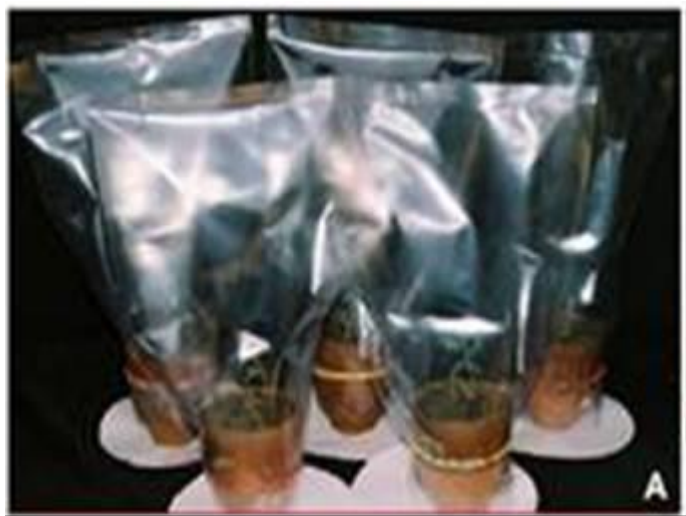
Figure 4. Sand and Potting mixture used for planting in vitro raised plantlets, respectively. Plantlets transferred to small earthen pots with a mixture of garden soil, sand and bio-manure in equal proportion. Freshly transferred plantlets covered with polythene bags.

containing soil mixture (Sunshine No. 4. Sun Gro Horticulture, Bellevue, Wash.), 20/15°C (day/night) and 16/8 h (light/dark) photo period with 200 \mu mol quanta/m 2 /s, established plants were transferred into bigger pots of same soil mixture and grown under greenhouse, 16/8 h (light/dark) photo period. Young plantlets were covered with transparent beakers to maintain humidity for 3 - 4 days and slowly acclimatized (Polowick et al., 2004). Sarmah et al. (2004) reported that in vitro shoot were grafted and grown under glass house condition. 65-75% of grafted shoots were established in glass house (Senthil et al., 2004). In vitro rooted and grafted shoots were transferred to pots containing soil: vermiculite; 1:1 and covered with transparent plastic bags. A cut was gradually extended over a 3 week period until the bag was completely open. After 15 - 20 days of transplantation, the plants were transferred to glass house (Singh et al., 2004).