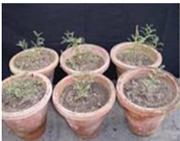
Figure 7. Plants of chickpea established in large earthen pots with a mixture of garden soil, sand and bio-manure in equal proportion.