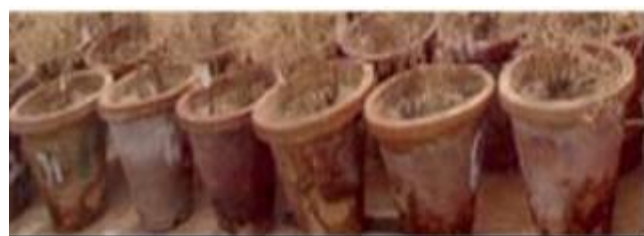
Figure 10. Harvesting stage of seeds after drying of pods and plants.

and seed production (Figures 9 - 10) (Anwar et al., 2008, 2009) was found to be superior in the plants obtained from the plantlets transferred to pots during October and