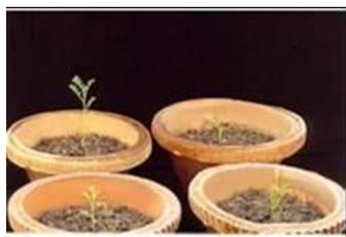
Figure 6. Plants of chickpea established in large earthen pots with a mixture of garden soil, sand and bio-manure in equal proportion.