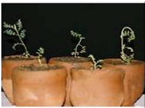
Figure 5. Acclimatized plantlets.