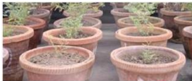
Figure 8. Plants of chickpea established in large earthen pots with a mixture of garden soil, sand and bio-manure in equal proportion.