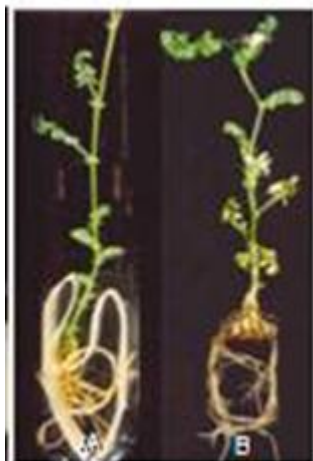
Figure 3. Shoots exposed to 10 sec 100 mM IBA pulse treatment, on liquid MS medium A: 14 d; B: 24 d after transfer of the elongated shoots (please note strong root system).

10 - 12 days old seedlings (Singh et al., 2004).