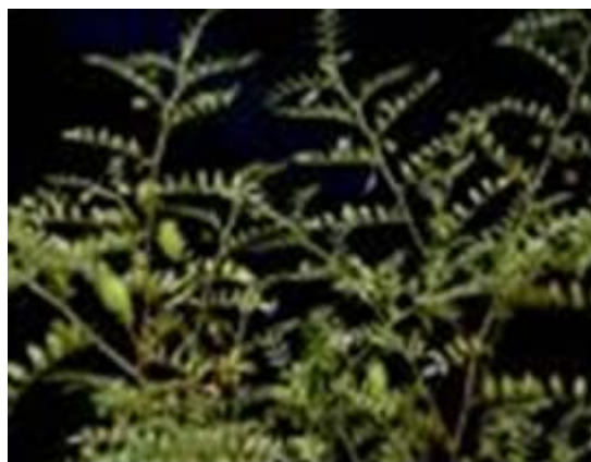
Figure 9. Plants showing pods and seed setting.